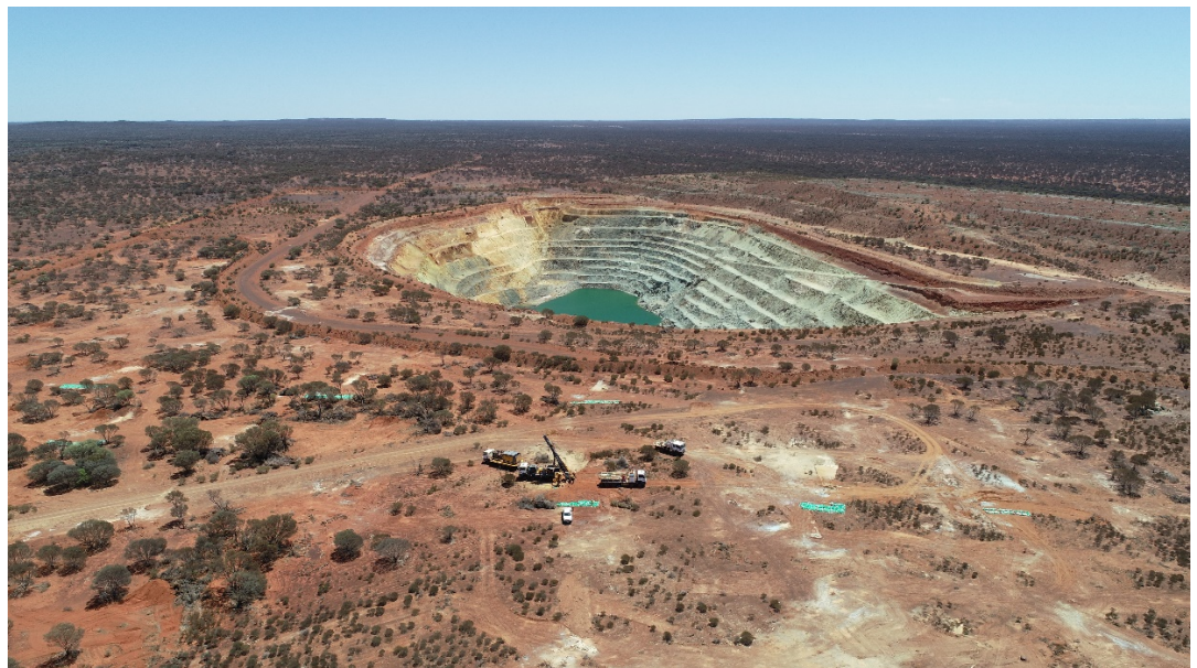
Figure 1. RC drilling underway at Lord Nelson

Alto Metals Limited (ASX: AME) ( Alto or Company ) is pleased to advise that its 2021 exploration program at its Sandstone Gold Project is now well underway, with the arrival of a second reverse circulation (RC) rig to accelerate drilling priority targets at the Lords Corridor.