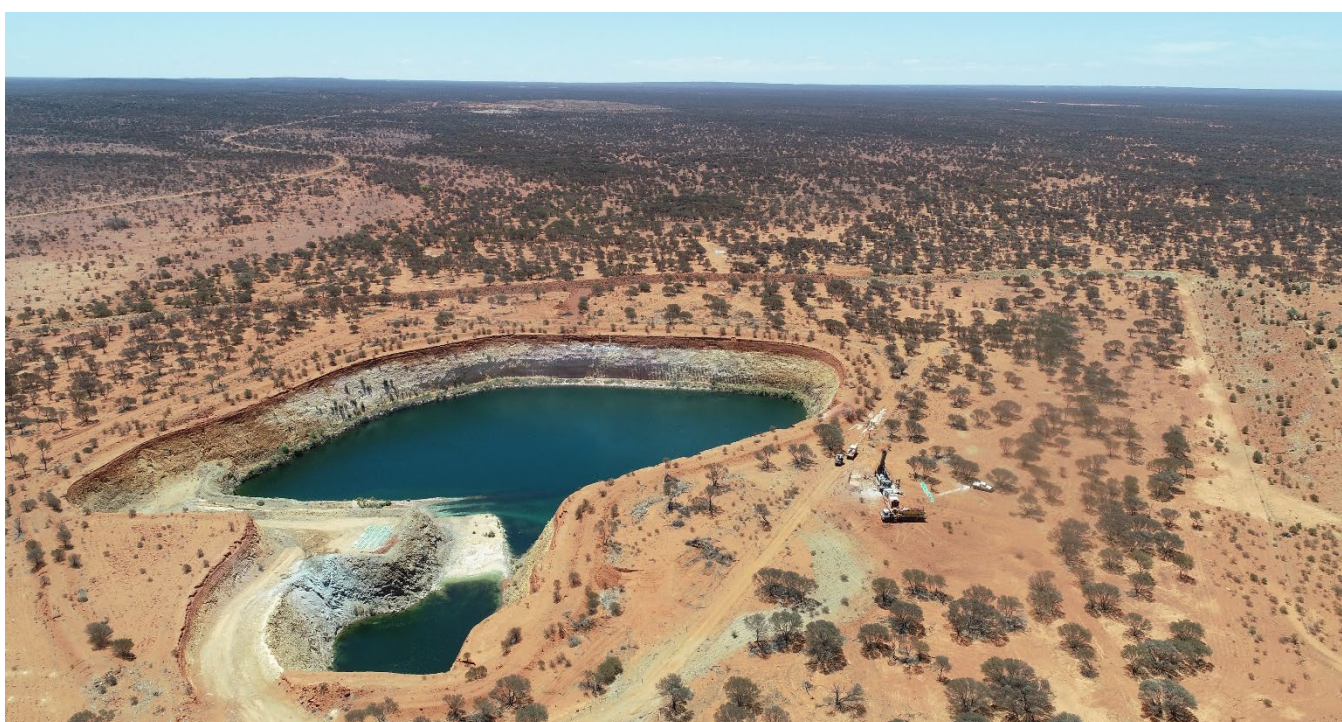
Figure 2. RC drilling underway at Lord Henry

The first RC rig will remain drilling at the Lords Corridor, including to test the new 32m thick zone of mineralisation identified from step-out drilling, over 800m south of the Orion Lode. Initial planning is underway as it is likely that the current program will be significantly expanded, subject to initial results.