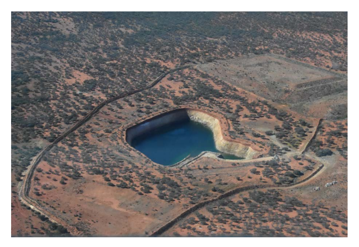
Figure 1. Lord Henry Open Pit 2017, Looking Northeast

As such, Snowden accepts responsibility for the geological interpretation, resource modelling and classification while Alto has assumed responsibility for the accuracy and quality of the underlying drilling data, compiled from WA Department of Mines and Petroleum, Open File WAMEX Reports.