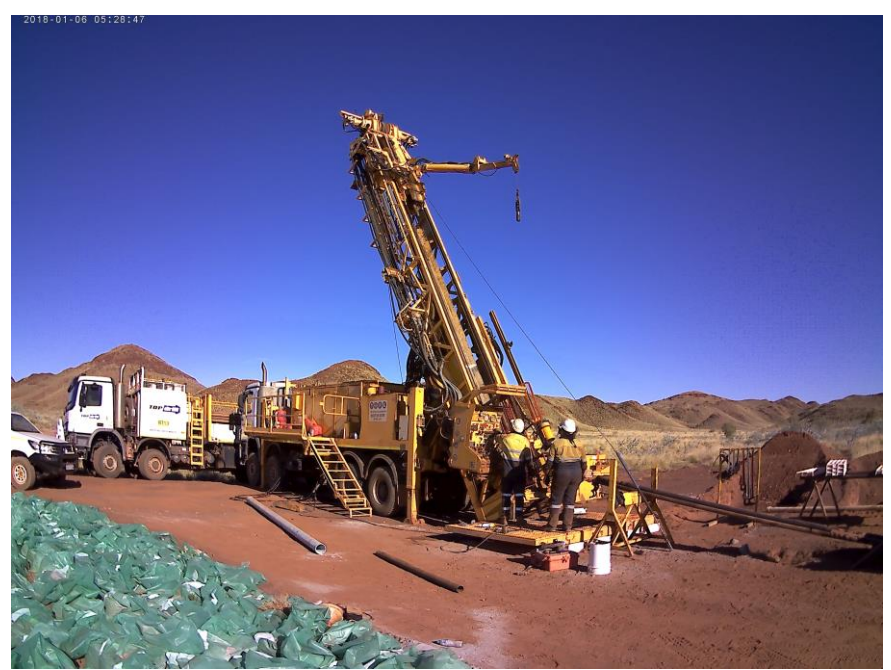
Fig 1 Topdrill diamond drill rig set-up near reverse circulation hole CRC007 at Top Camp.

8 metres at 10.2g/t Au, in CRC007 from 135 metres 7 metres at 1.4 g/t Au, in CRC009 from 58 metres 19 metres at 0.69 /t Au, in CRC013 from 51 metres