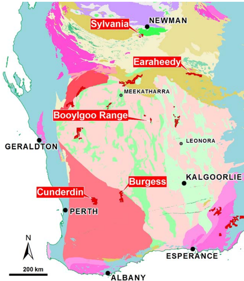
Figure 3. Enterprise Metals Ltd – Iron Exploration Projects

The Company considers that potential exists for substantial deposits of iron ore and possibly gold and base metals concealed below laterite and other thin Cainozoic soil and sand cover.