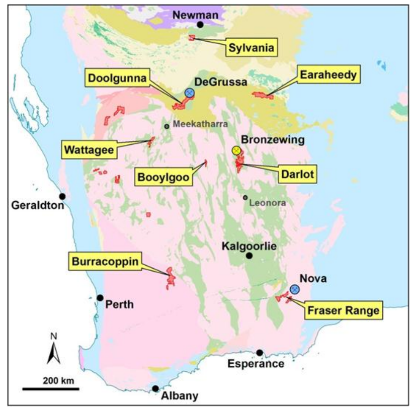
Enterprise Projects at 31<sup>st</sup> December 2012

The Company continued exploration activities on its gold/base metals, uranium and iron ore projects in Western Australia. Activities undertaken by the Company are summarised by project below: