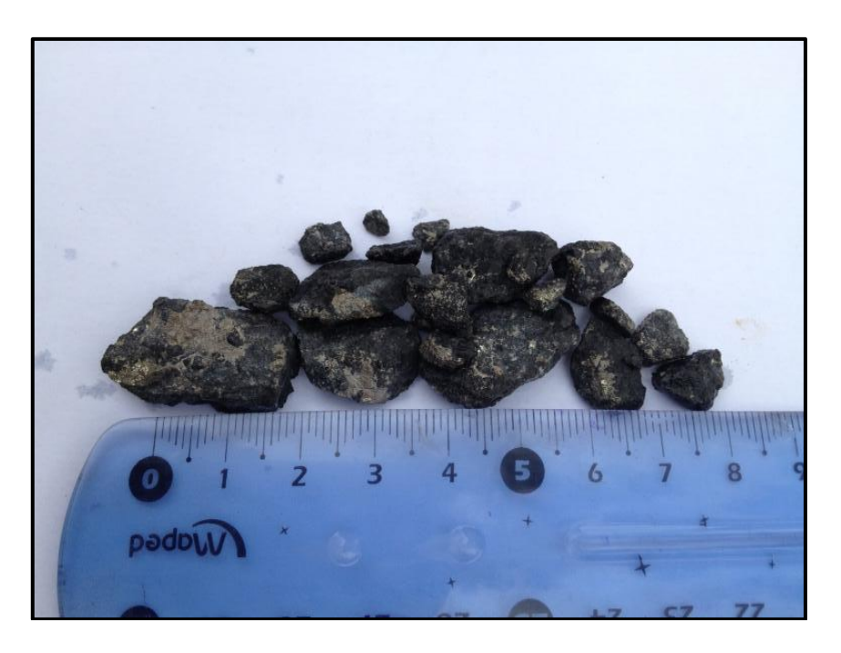
Plate 1. Selected drill chips, PLRC002, Interval 225-226m

Examination of drill chips from holes PLRC001 and PLRC002 is in progress, but laboratory assays are not expected for about 10 days. An example of pyrrhotite bearing drill chips from PLRC002 is attached below. Cautionary note: These chips were selected from the chip tray and are not necessarily representative of the 1 metre interval from which they came, nor are they representative of all intervals containing disseminated pyrrhotite.