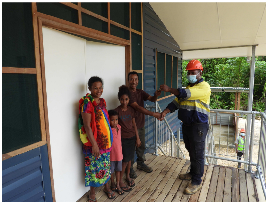
Figure 3: Handover of first relocation house.

This engagement program is due for completion in the June 2021 quarter, by which time it is expected that all of the necessary registrations and governance processes will be in place to enable Landowner Companies to tender for contract opportunities.