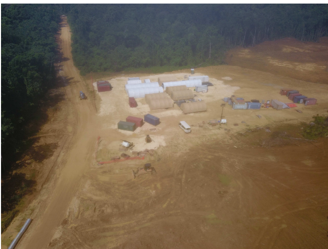
Tented Construction Camp