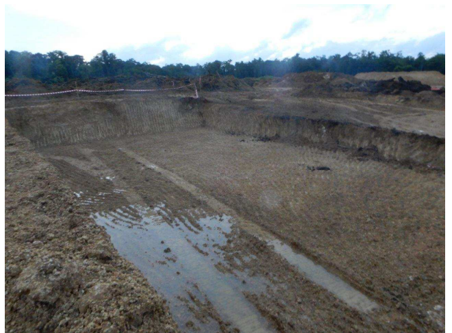
Process Plant Boxcut