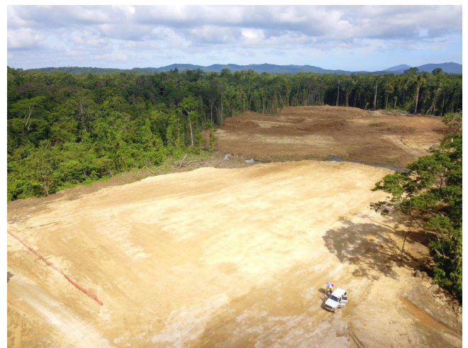
Permanent Camp Pad