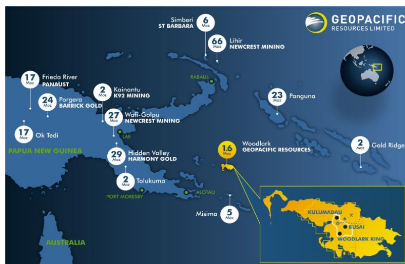
Figure 1: Woodlark Island location Map

Woodlark is located on an Island, 600km East of Port Moresby, in Milne Bay Province of Papua New Guinea.