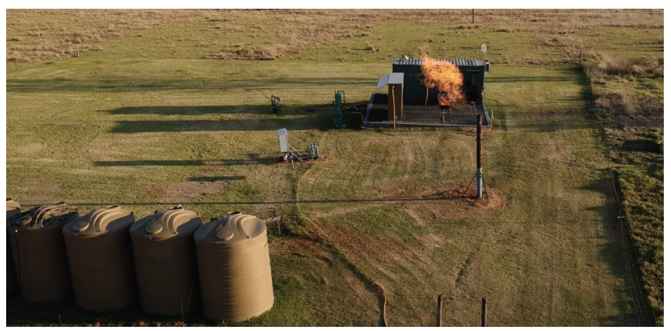
Figure 1 - Pilot production well KA-03PT flaring gas at Amersfoort Project

Afro Energy contracted Endress & Hauser AG and Franklin Electric Co to repair and upgrade its existing downhole and surface equipment to ensure safe and continuous production during the delivery period. Endress Hauser further allowed the use of its equipment used during a previous equipment test to optimise the surface separation of water and gas (ASX Announcement 12 September 2018). The workover of wells will commence subsequent to the completion of equipment repairs and upgrades currently undertaken when waterpipe, sensors and downhole water pumps will be pulled to surface for inspection, servicing and/or replacement. Completion of the workover program is schedule for mid-December 2020.