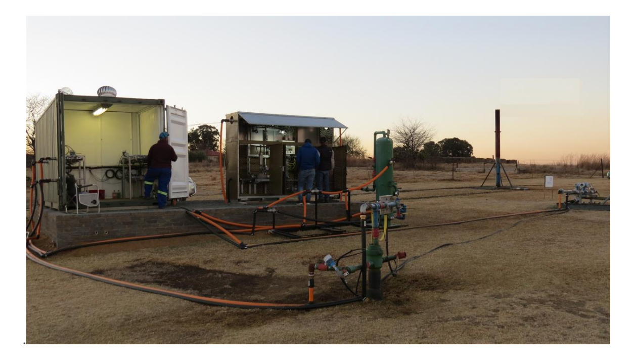
Figure 2. – Gas separator and well head equipment on Well KA-03PTR

These achievements and the ongoing merger of the Afro Energy joint venture have elicited a number of positive responses from potential funding institutions both inside South Africa and abroad to fund and participate in the Amersfoort project development and in particular the potential development of a pilot production field. Afro energy remains in discussions with a number of interested funding parties.