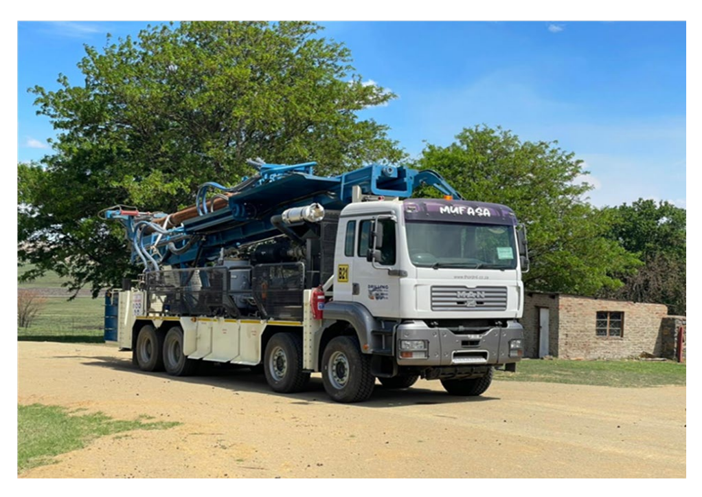
Figure 1 – 28 ton rig B16 for rotary mud drilling

Korhaan-5 using percussion/air once more, expecting all drilling activities to be completed by early December. All three wells will be flow tested after logging. The Company intends early in 2022 to return and case, cement and perforate each well in order to maximise gas production while minimising or negating water ingress.