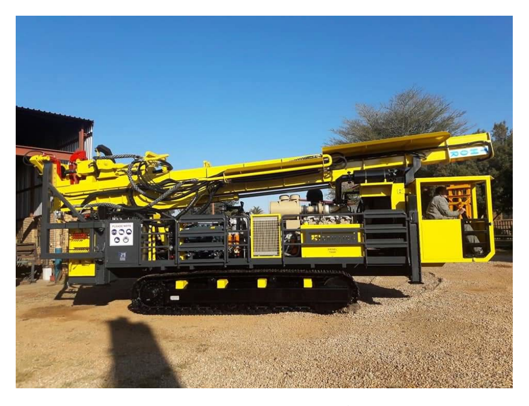
Figure 2 – 37 ton rig B21 for percussion/air drilling