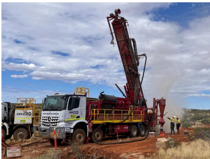
Figure 1: Topdrill RC Drill Rig on the Lyons LI03-01 Southern Prospect

Lanthanein Resources Ltd (ASX: FNT) ( Lanthanein or the Company ) is pleased to announce that drilling (Figure 1) has commenced at the Lyons Rare Earths Project in Western Australia ( Lyons Project ). The proposed drill program will target high-grade rare earth mineralisation discovered at the outcropping ironstones and additional interpreted carbonatite intrusives and ironstones undercover at Lyons (Figure 2).