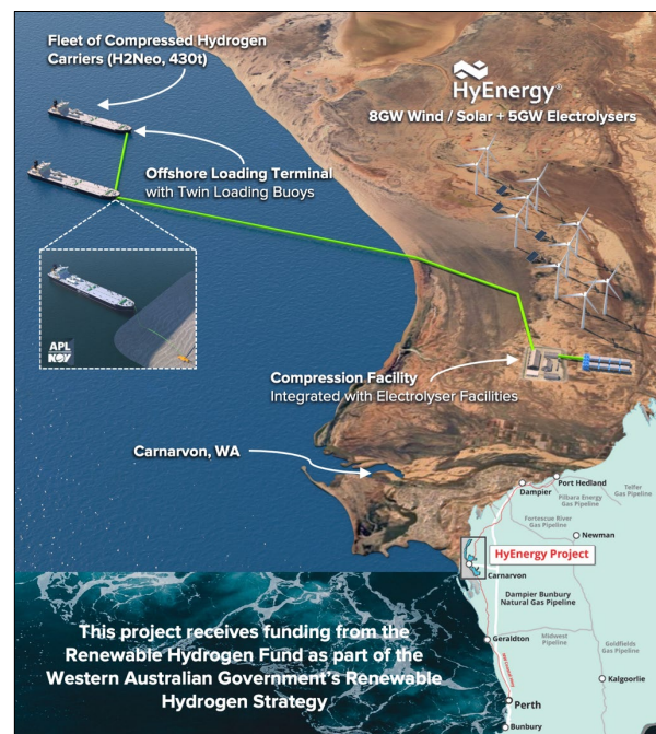
Figure 1: Overview of the HyExport Study export utilising offshore loading. Site locations are conceptual only.

Notice: This Project receives funding from the Renewable Hydrogen Fund as part of the Western Australian Government's Renewable Hydrogen Strategy. For further information visit www.wa.gov.au/renewablehydrogen