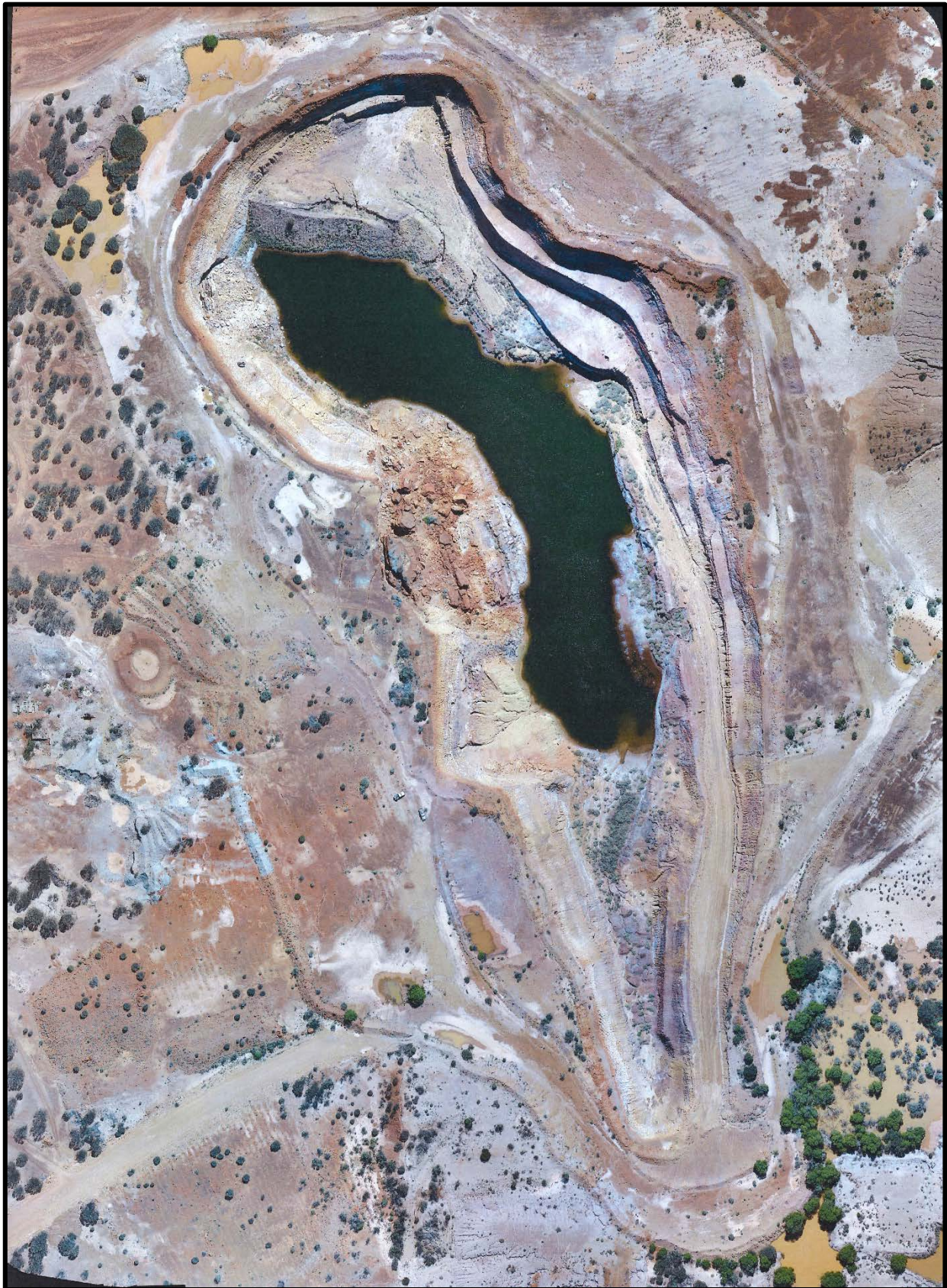
Figure 1. Alto Drone Image of Oroya Open Pit, Sandstone WA