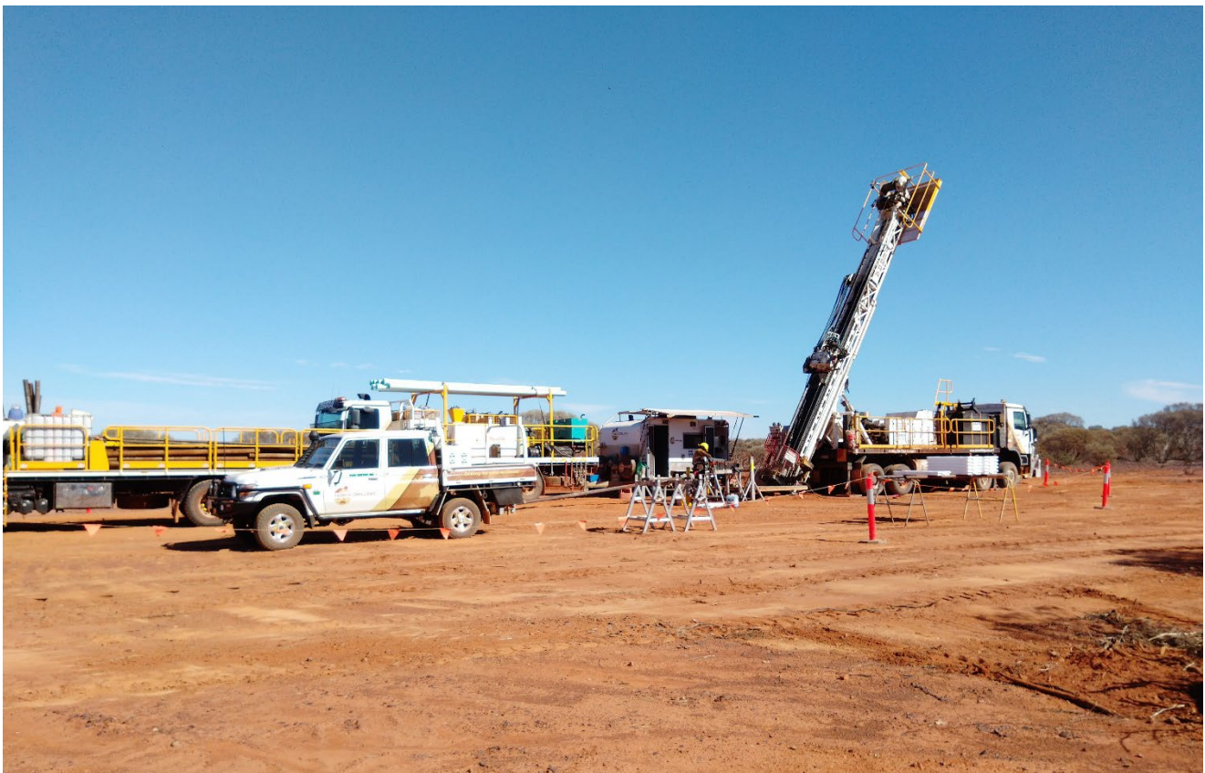
Figure 1: Diamond drill rig at Lord Nelson.