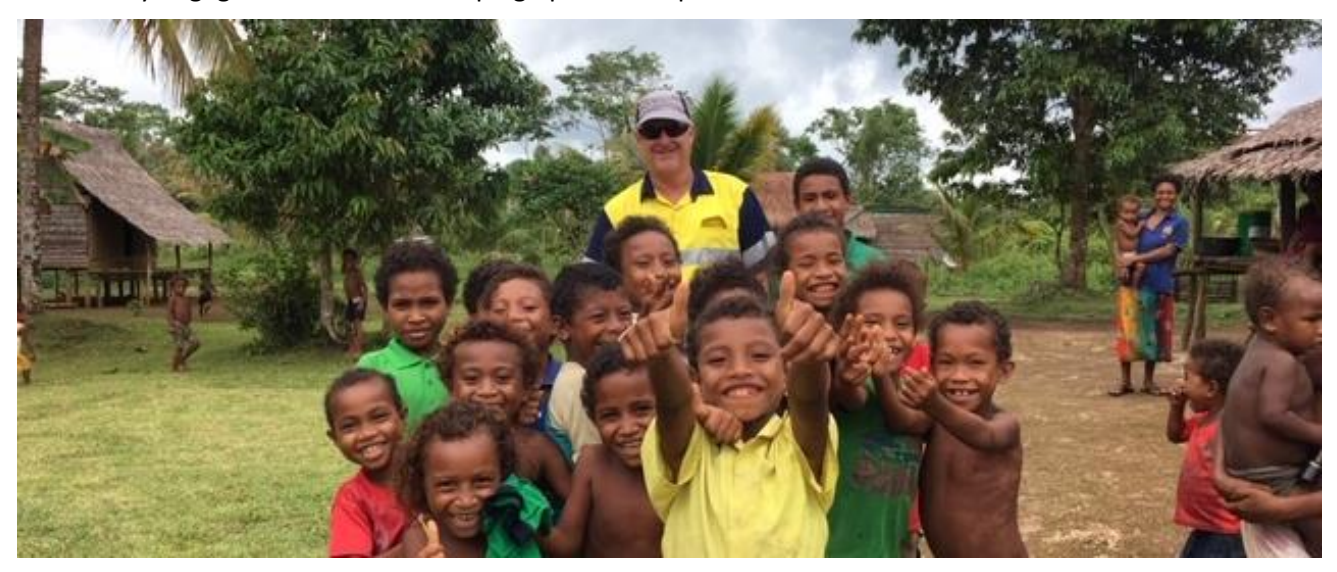
Figure 11: Community relations extensive and ongoing

Community consultation has been extensive and is ongoing, with detailed planning, preparation and community engagement activities ramping up over the period.