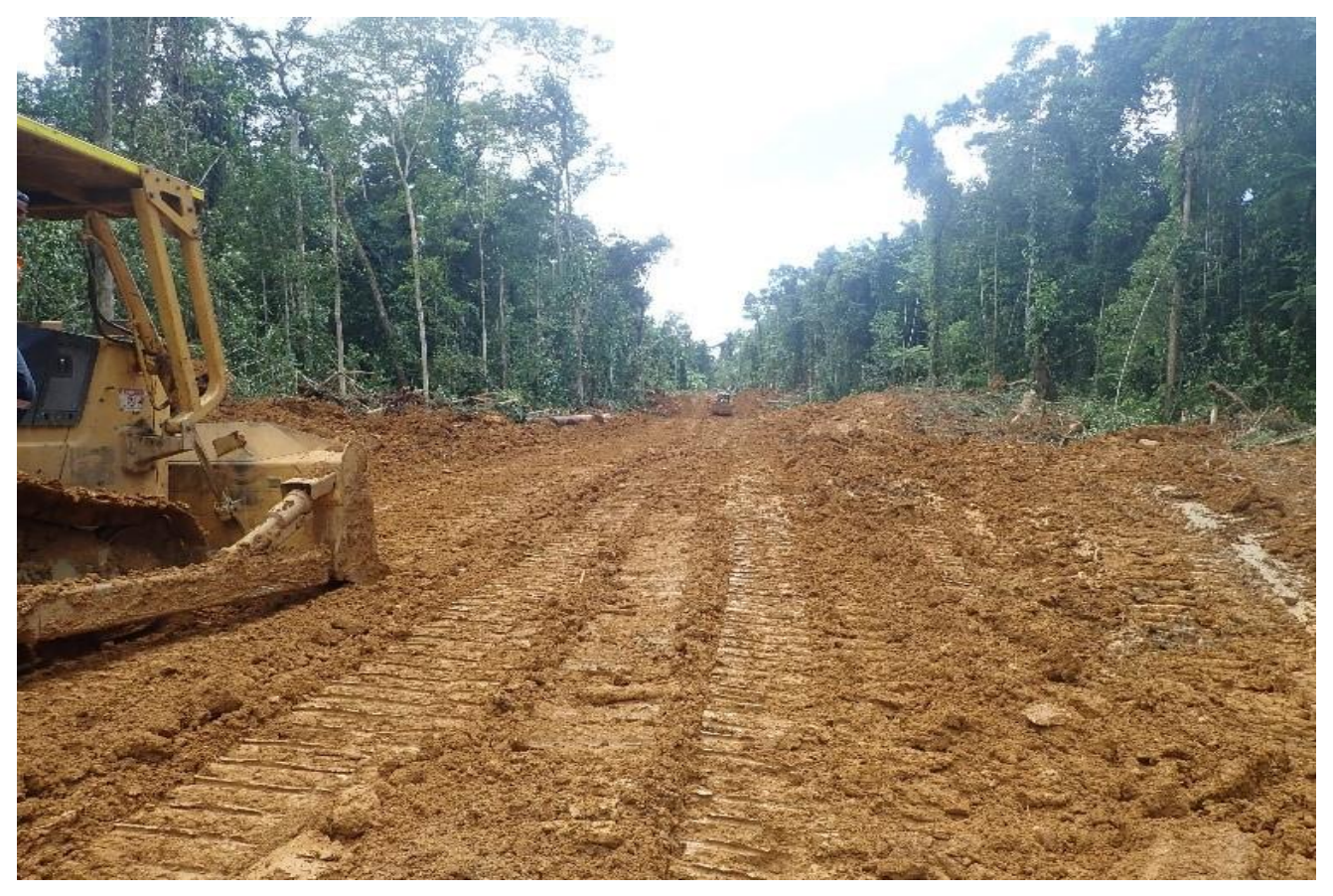
Figure 1: Wharf road development

Meeting critical milestones not only ensures the Woodlark Gold Project remains on track, it demonstrates that Geopacific have the requisite skills and capabilities to do business in Papua New Guinea. This success is a reflection on the competence of the Geopacific team and a co-operative local Woodlark Island community."