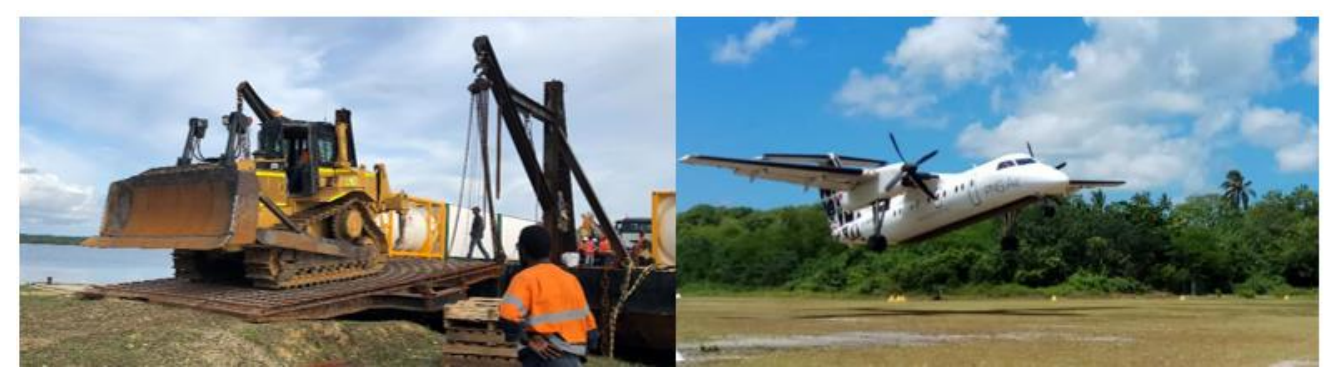
Figure 2: Equipment Mobilised to site by Barge

Personnel were transported to site on a 36 seat Dash 8 charter flight. This was the first time a plane of that size has landed on Woodlark Island and was the result of a collaborative process between Geopacific and PNG Air, which has been ongoing since the exploration phase of the Woodlark Gold Project. Geopacific and PNG Air are continuing to work together to organise regular commercial flights to the Woodlark Gold Project.