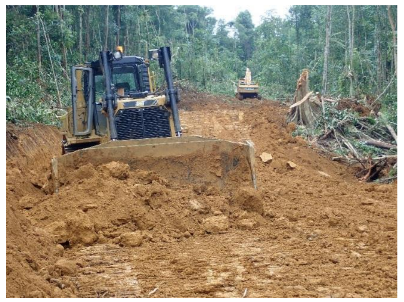
Figure 5: Wharf road pioneering works

Following the clearing work of the plant site, HBS have concentrated on repairing existing roads and pioneering of the road to the planned Wharf, of which 4.3km has been cleared.