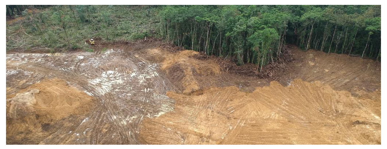
Figure 4: Plant Site Clearing

Upon arrival and mobilisation on site HBS commenced clearing of the process plant site to prepare for Geophysical testing and Geotechnical drilling. These works were successfully completed in February 2020. Further preparation of the plant site will be conducted based on the analysis of the Geotechnical work.