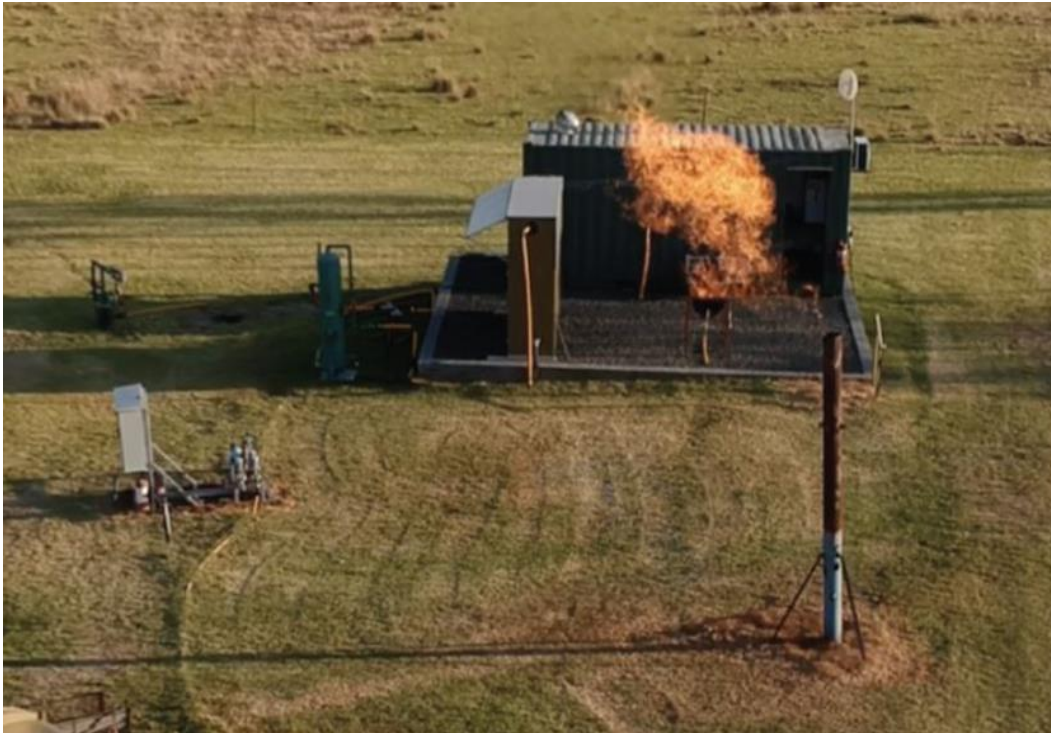
Figure 2. Gas pilot production well number KA-03PT that achieved a stabilised flow rate of 332 Mscf/day.

This announcement is authorised for release to the market by the Board of Directors of Kinetiko Energy Limited