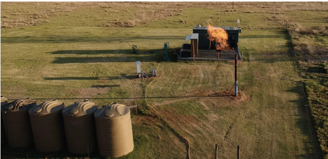
Figure 1 - Pilot production well KA-03PT flaring gas at Amersfoort Project

Afro Energy contracted Endress & Hauser AG and Franklin Electric Co to repair and upgrade its existing downhole and surface equipment to ensure safe and continuous production during the delivery period. Endress Hauser further allowed the use of its equipment used during a previous equipment test to optimise the surface separation of water and gas (ASX Announcement 12 September 2018). The workover of wells will commence subsequent to the completion of equipment repairs and upgrades currently undertaken when waterpipe, sensors and downhole water pumps will be pulled to surface for inspection, servicing and/or replacement. Completion of the workover program is schedule for mid-December 2020.