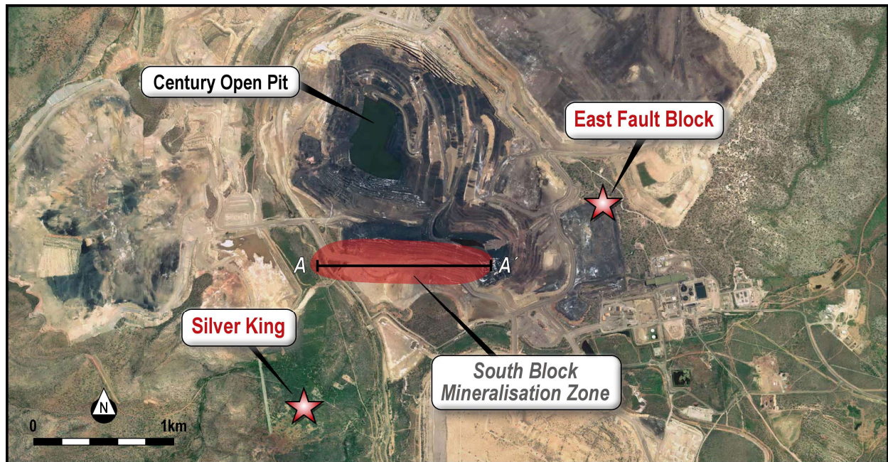
Figure 3: Plan view of long section A-A' through the South Block mineralisation