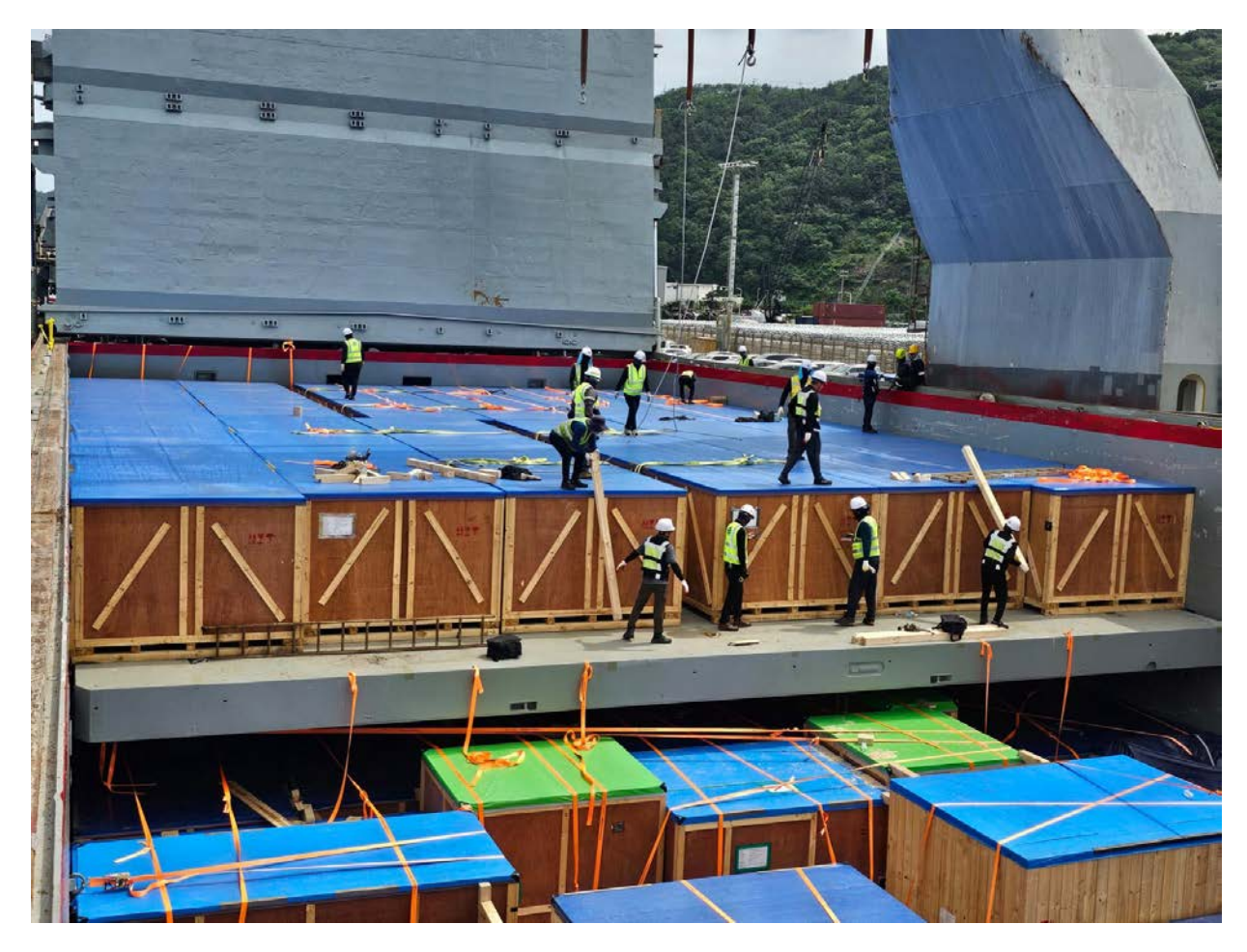
Figure 10: Power Station ancillary equipment loaded into charter vessel (7 June 2025)