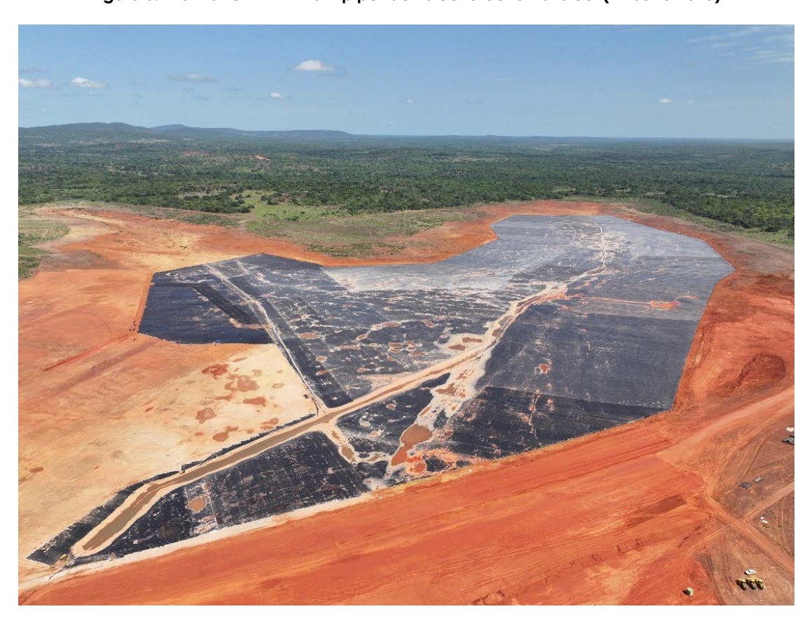
Figure 4: Tailings storage facility showing the extent of lining and main embankment construction (7 June 2025).