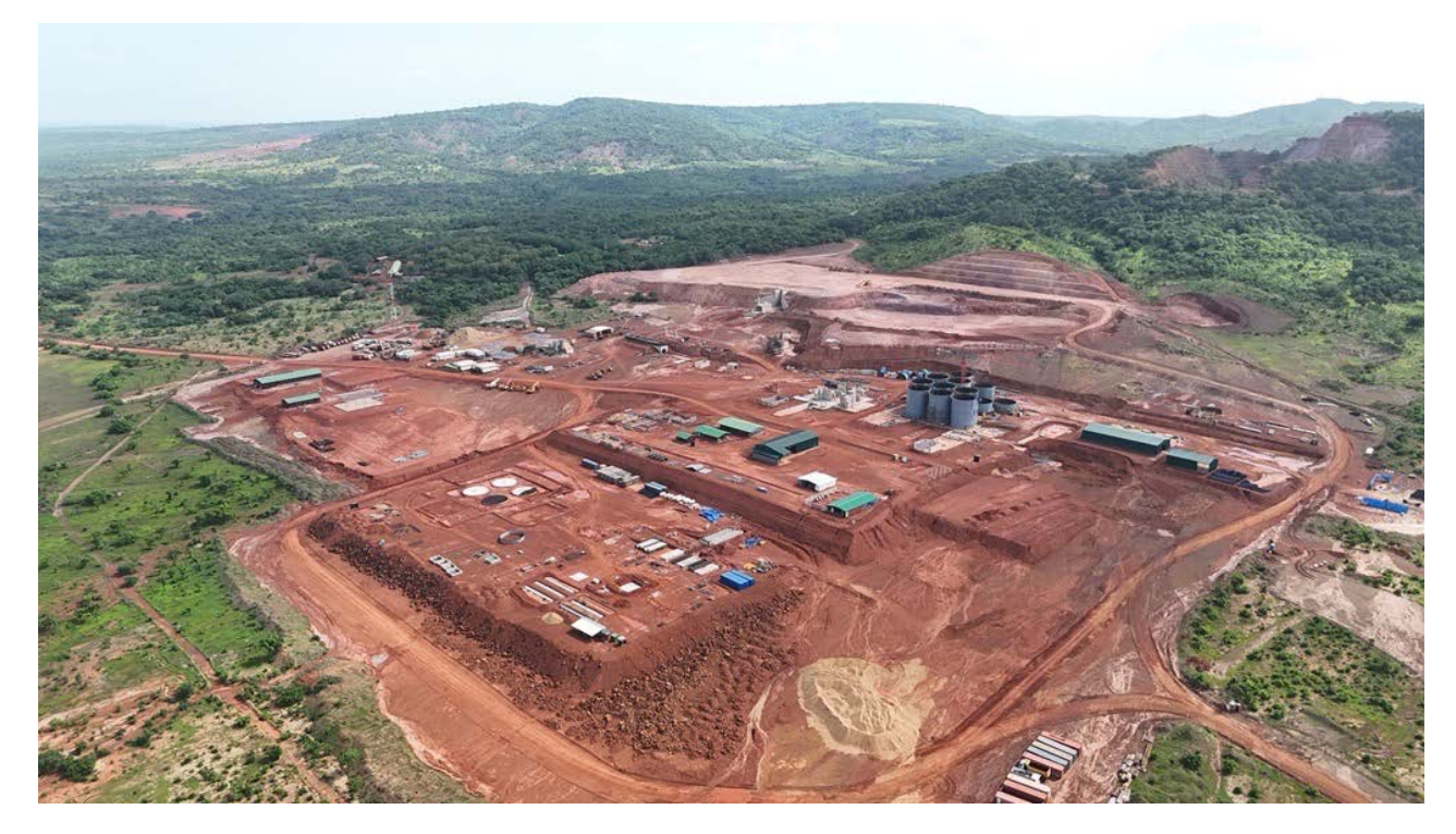
Figure 1: Aerial view of the Kiniero site showing process plant and infrastructure (9 June 2025)