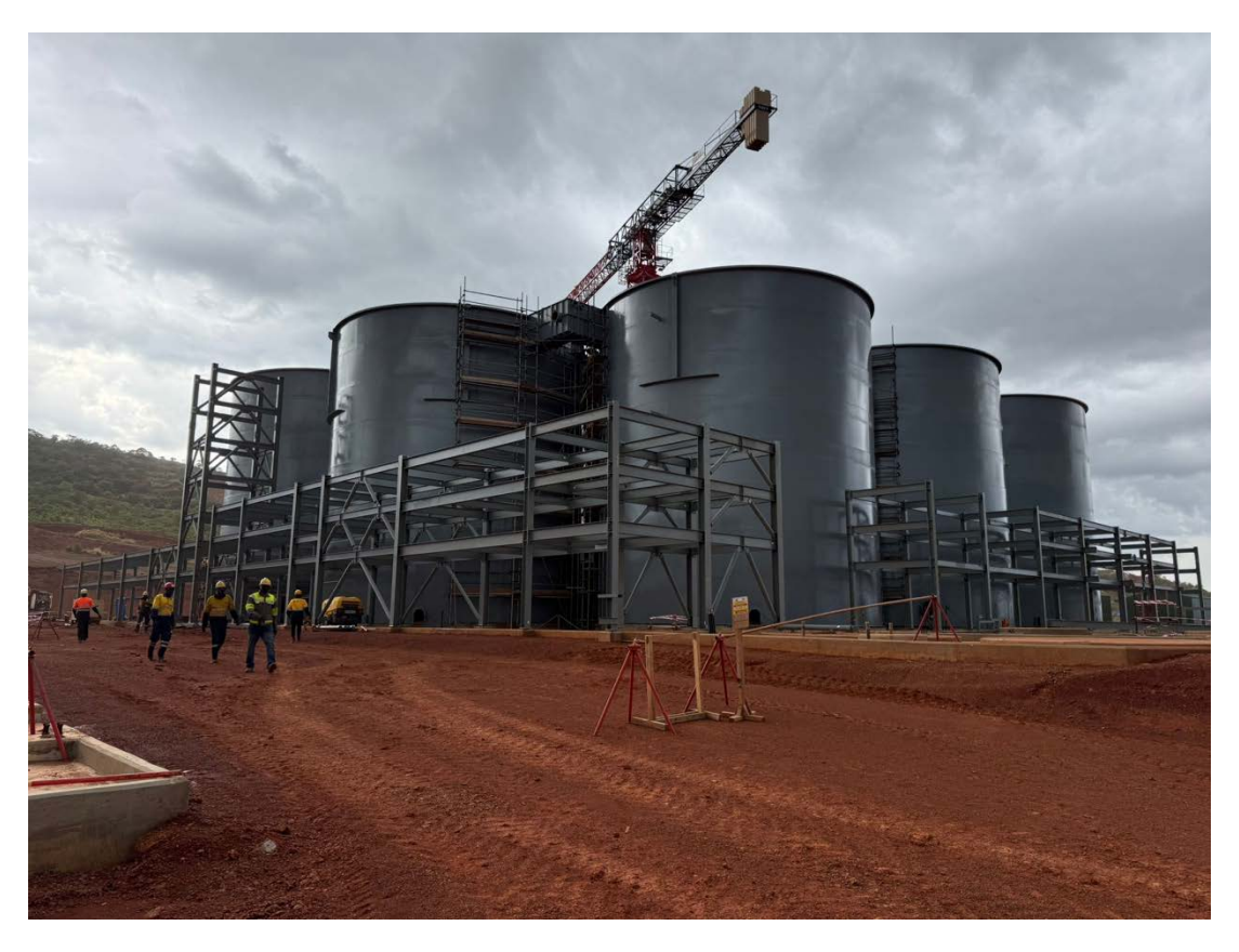
Figure 3: View of CIL with main pipe rack steel erection of steel (11 June 2025)