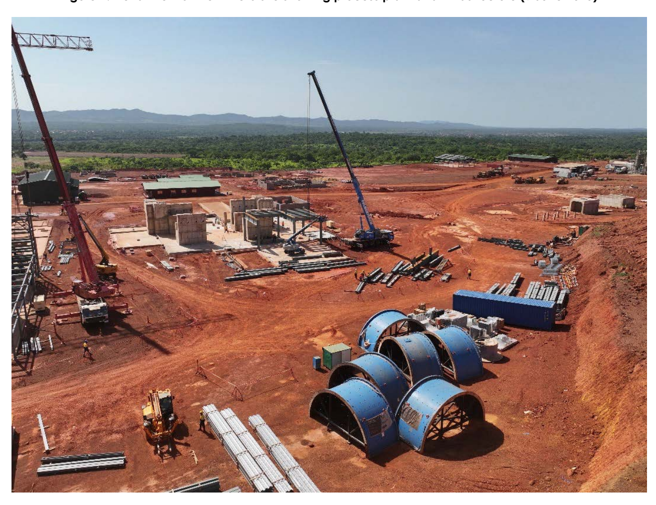
Figure 2: View of Milling building showing erection of steel (7 June 2025)