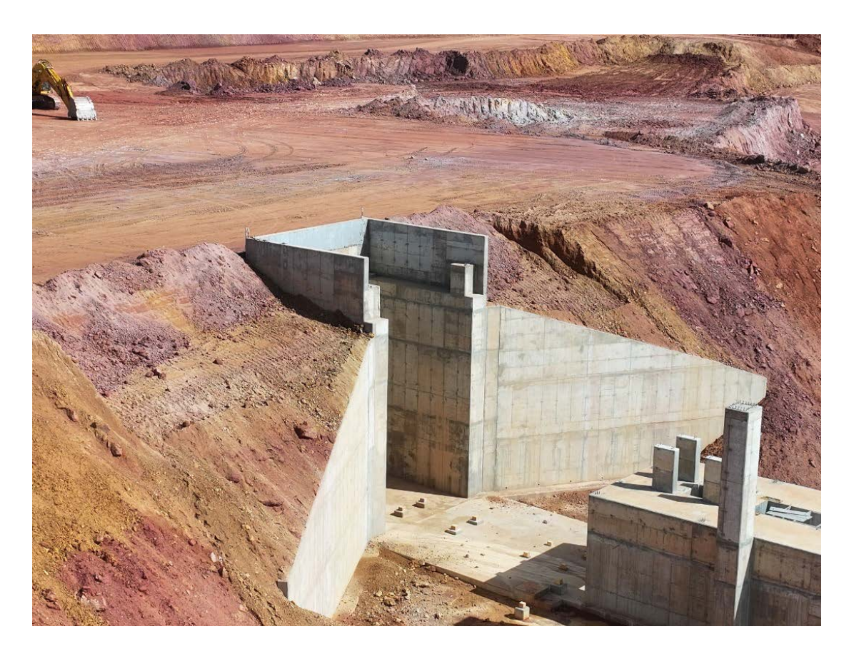
Figure 6: Primary crusher ROM pad and chamber (7 June 2025)