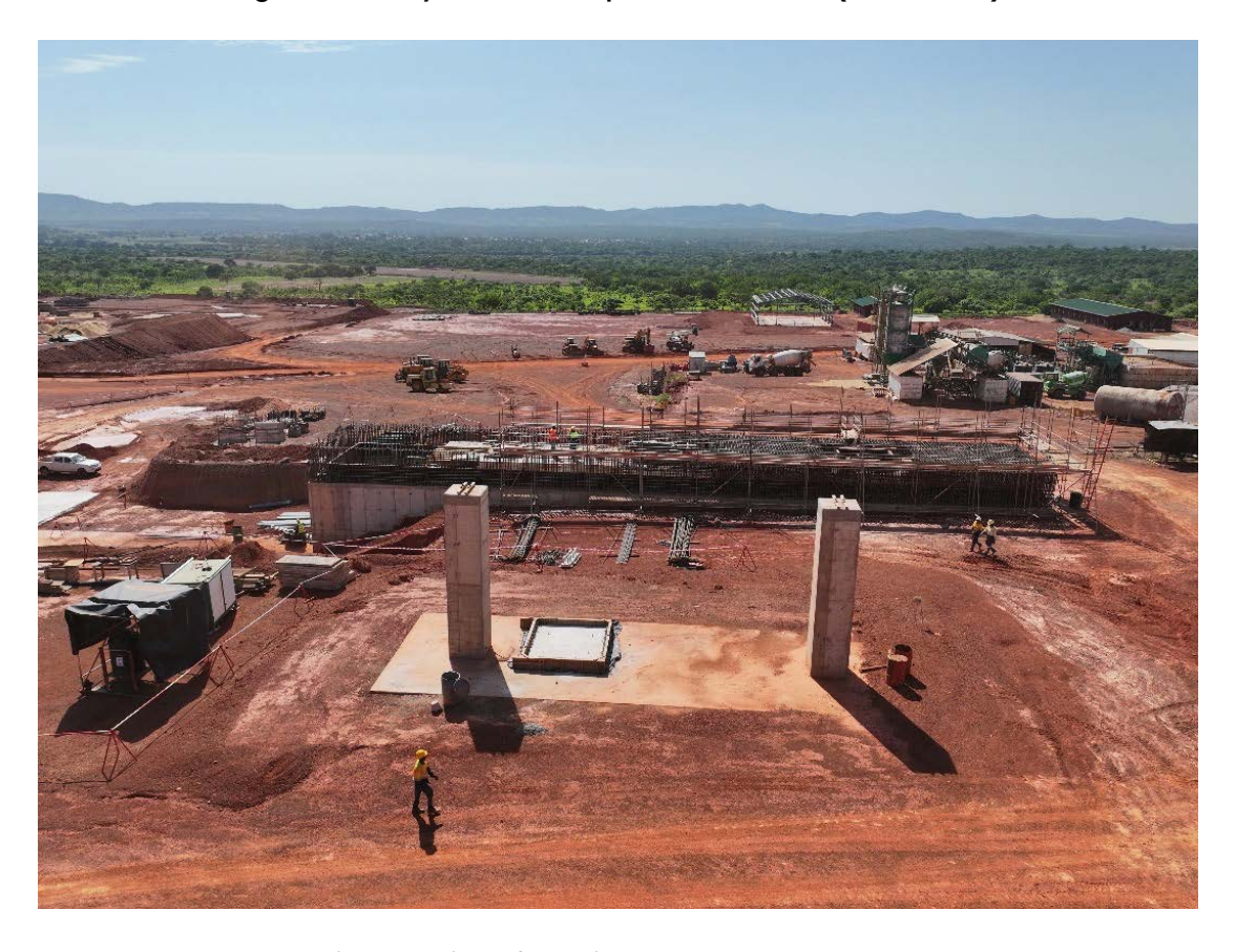
Figure 7: View of reclaim chamber (7 June 2025)