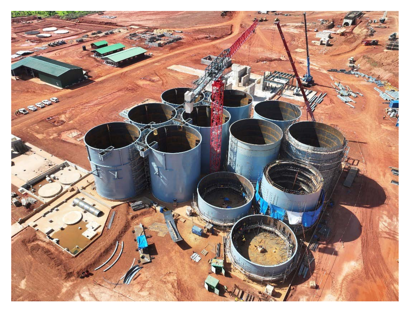
Figure 5: View of the Milling and CIL looking west (7 June 2025)