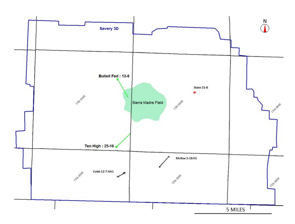
Map of Battle Mountain AMI showing proposed 2016 GRMR well locations and 2015 GRMR drilled wells

During the quarter Entek received the details and costings of GRMR's proposed 2016 drilling campaign, comprising two wells located within the Battle Mountain AMI (refer well location map below). Entek's working interests in these wells range from 17.68 to 18.36% with a total cost exposure of up to US$1.214 million for its share of drilling, completion and testing costs. The well locations are based on 3D seismic and targeting natural open fractures by drilling high angle and/or horizontal paths within the Niobrara.