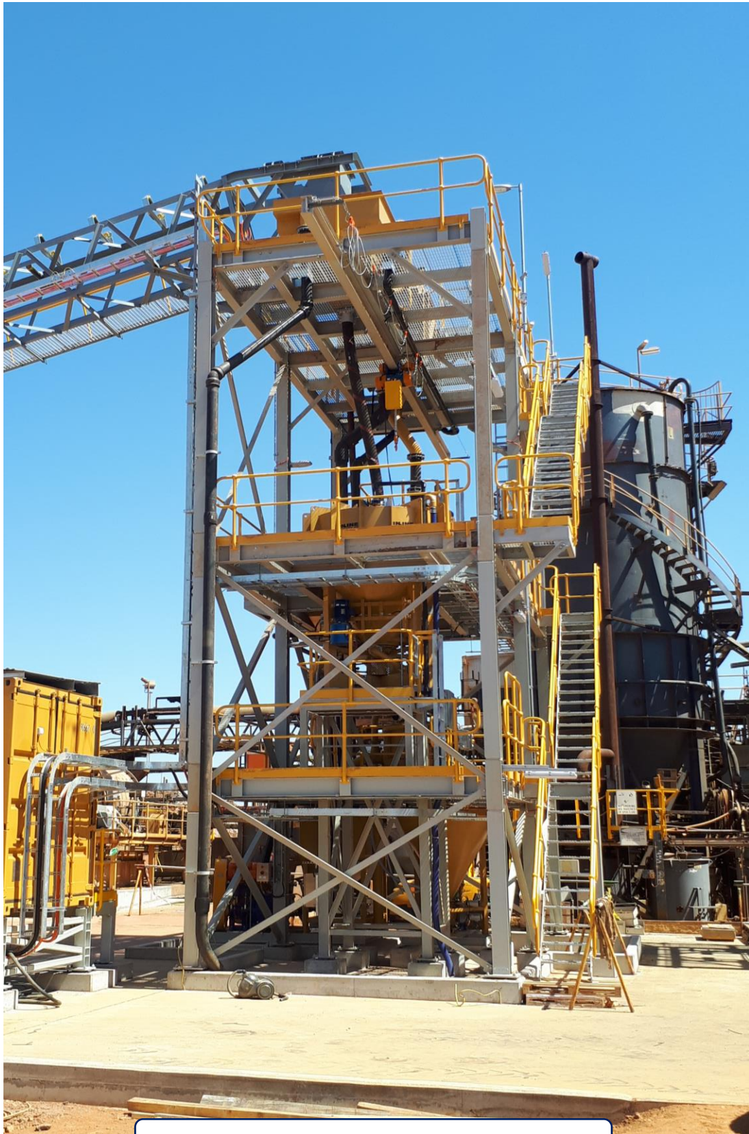
Figure 2 – Gravity Concentrator Tower