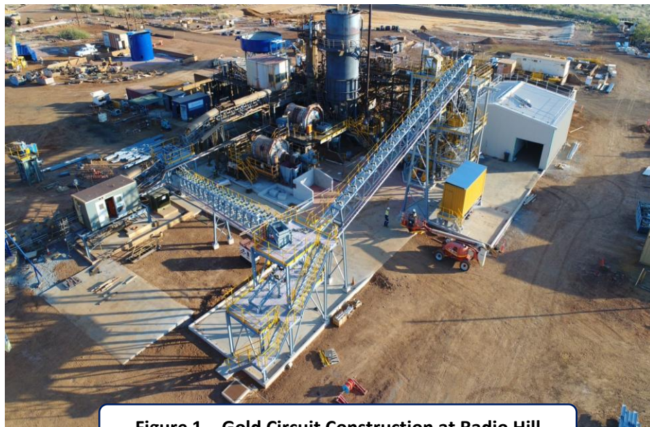
Figure 1 – Gold Circuit Construction at Radio Hill

Artemis Resources Limited (“Artemis” or “the Company”) (ASX: ARV) is pleased to provide this update on construction of the company’s 100% owned Radio Hill process plant.