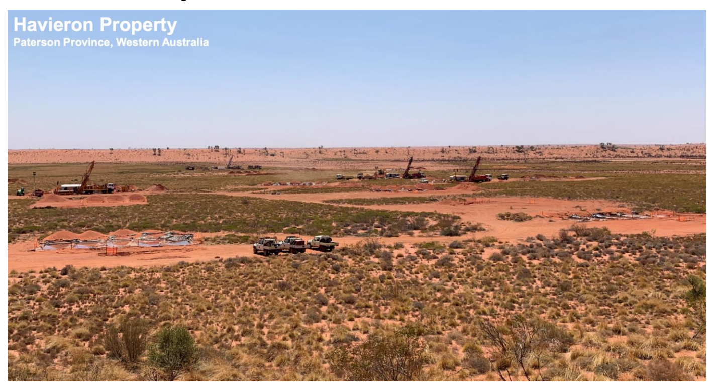
Figure 2: Recent image of Newcrest drilling the Havieron JV close to the Paterson Central Project.

The Artemis Paterson Central Project surrounds on three sides, and in close proximity to what is potentially a very significant gold and copper discovery at Havieron by Greatland Gold PLC (GGP.L) and subsequently Newcrest (NCM.AX) via a circa A$100m Farm-in agreement.