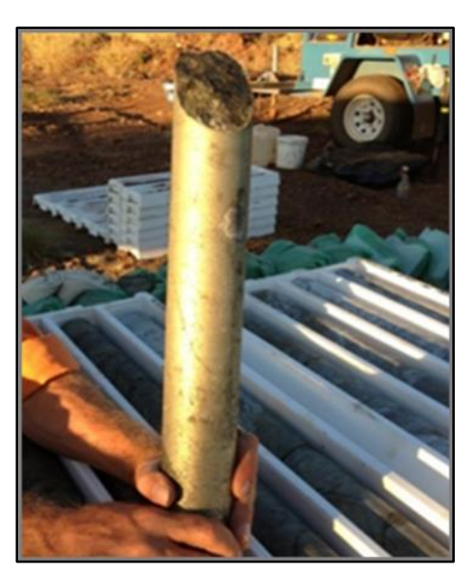
Figure 2: Massive chalcopyrite from diamond drillhole HCDD001