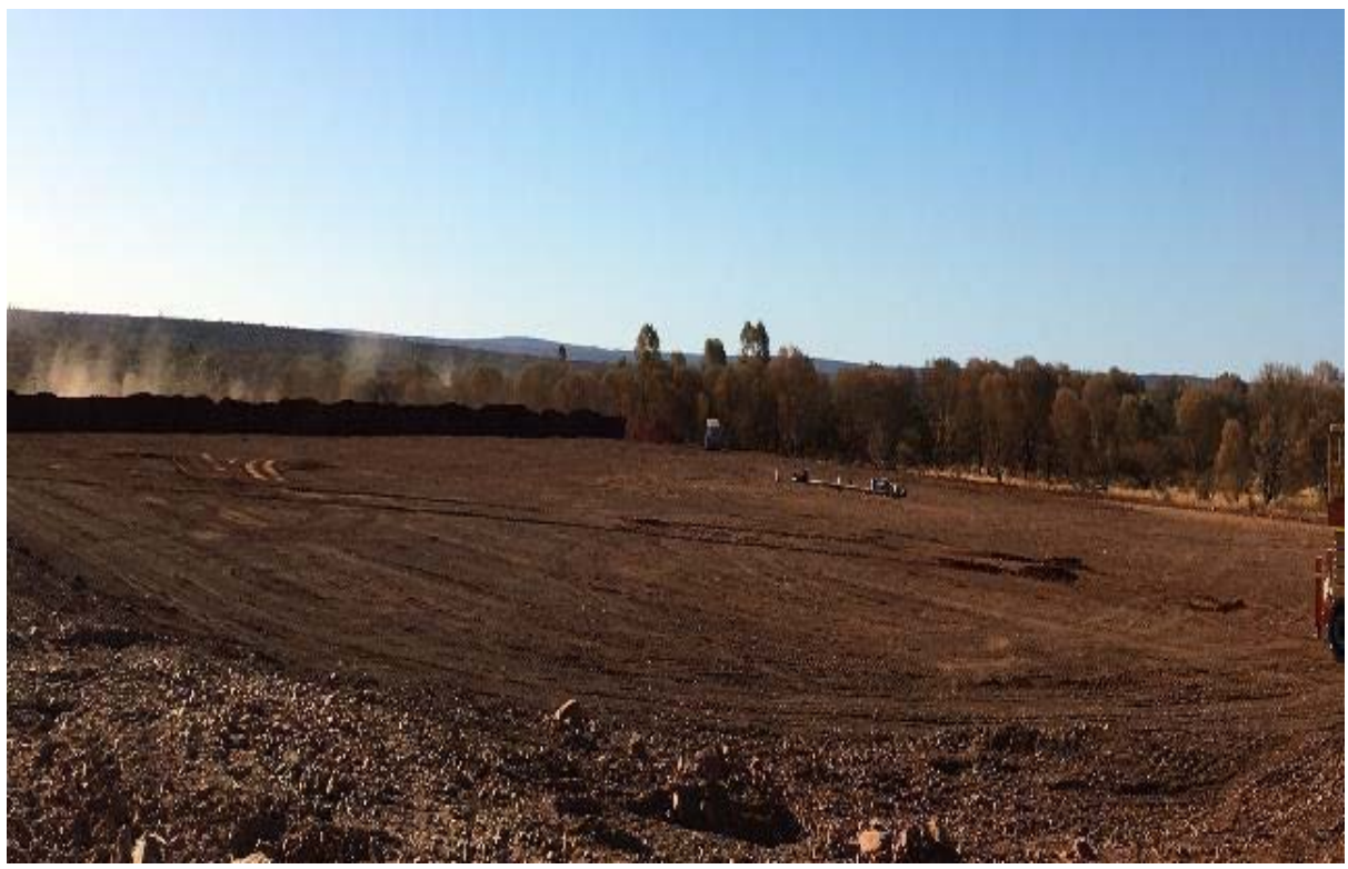
Figure 3 – Workshop Pad

A borrow pit has also been established adjacent to the haul road and high quality gravel identified. This will be used as sheeting on the haul road.