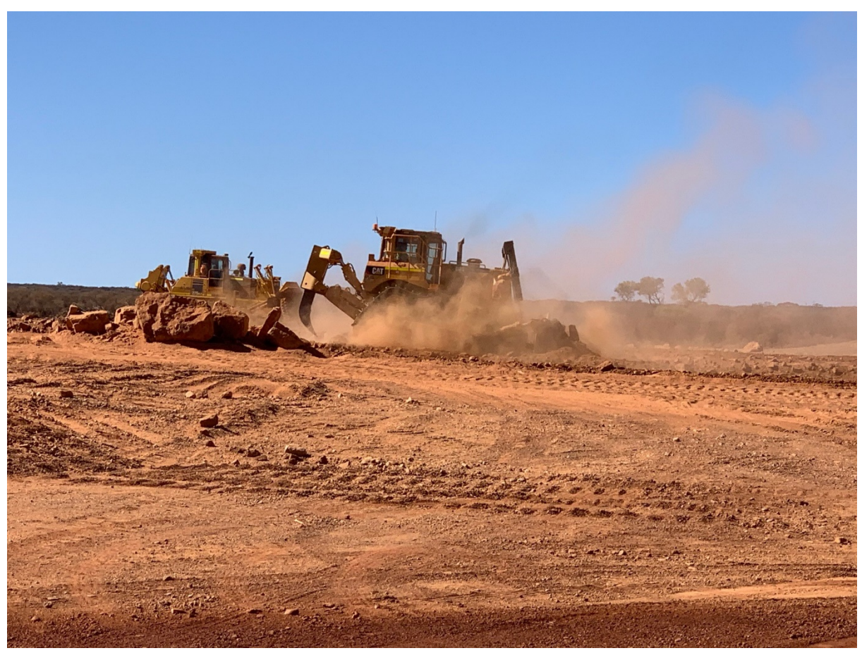
Figure 5 – Crusher Pad Earthworks