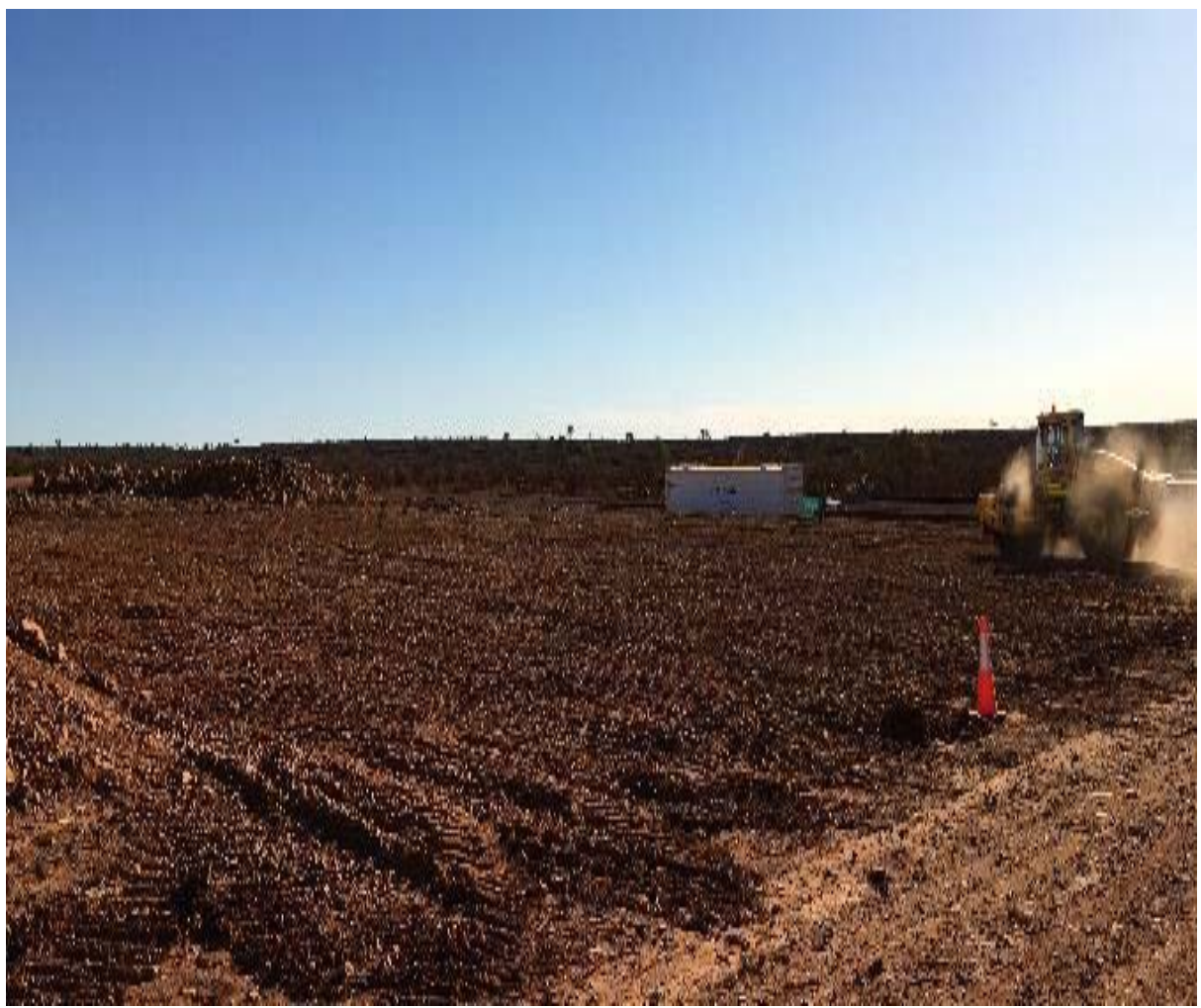
Figure 4 – Drill & Blast Laydown Area