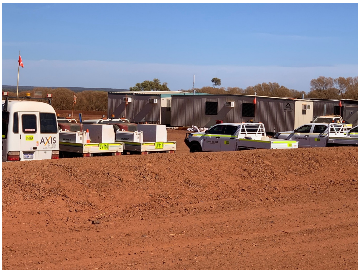
Figure 7 – Site Offices