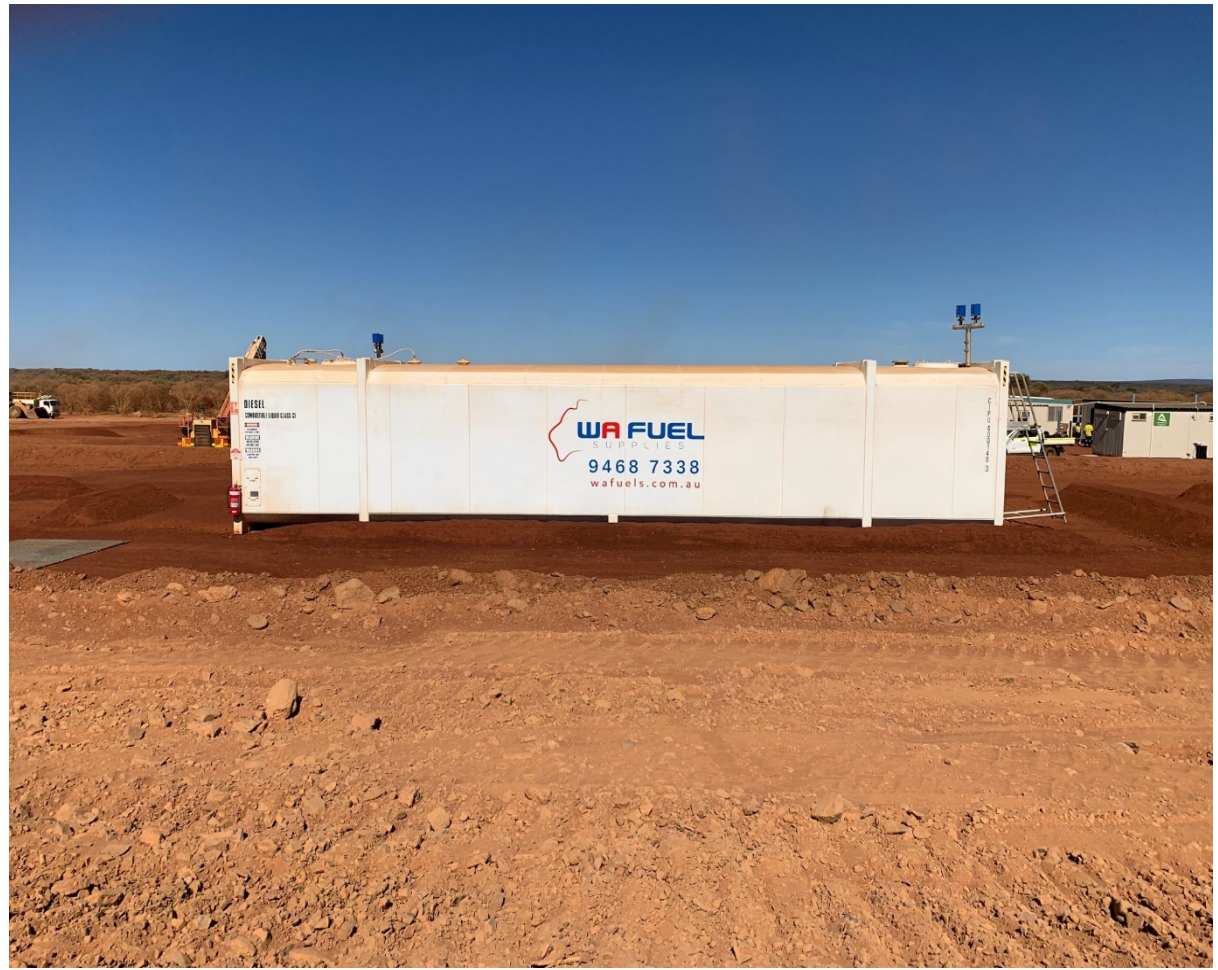
Figure 6 – Fuel Farm