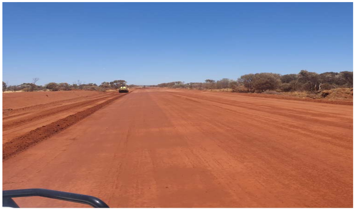
Figure 8 – The Northern Haulage Road under construction

Establishment of a road user agreement with the MRD for the Goldfields Highway (Wiluna – Meekatharra Road) to Meekatharra, which includes gravel sections and tar seal is in progress.