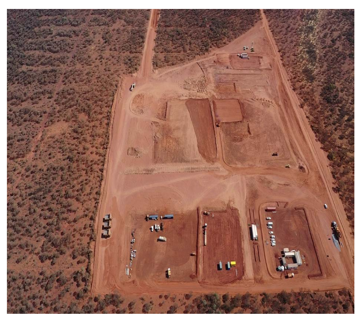
Figure 1: C4 Iron Deposit Site Operations including ROM Pads and other facilities

The Company is on track to meet its project production milestones (refer Table 1)