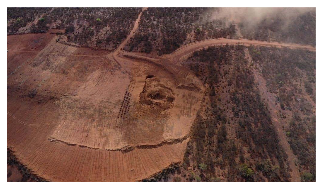
Figure 2: Production Drill Blasting Commenced

The first production drill blasting commenced on 3<sup>rd</sup> December 2020 undertaken by experienced operator Dynamic Drill and Blast (ASX: DDB) (Figure 2)