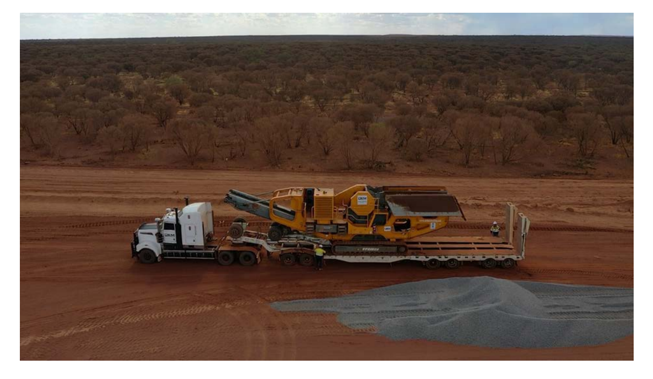
Figure 3: Jaw Crusher arrived on Site

Formal Mining Works Approval (required for crushing and screening operations) is in place from the Department of Water and Environmental Regulation with the finalising the requirements associated with the granting.