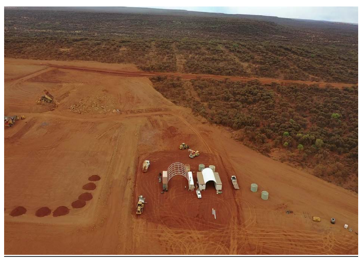
Figure 3: C4 Mining Operations On-site Facilities