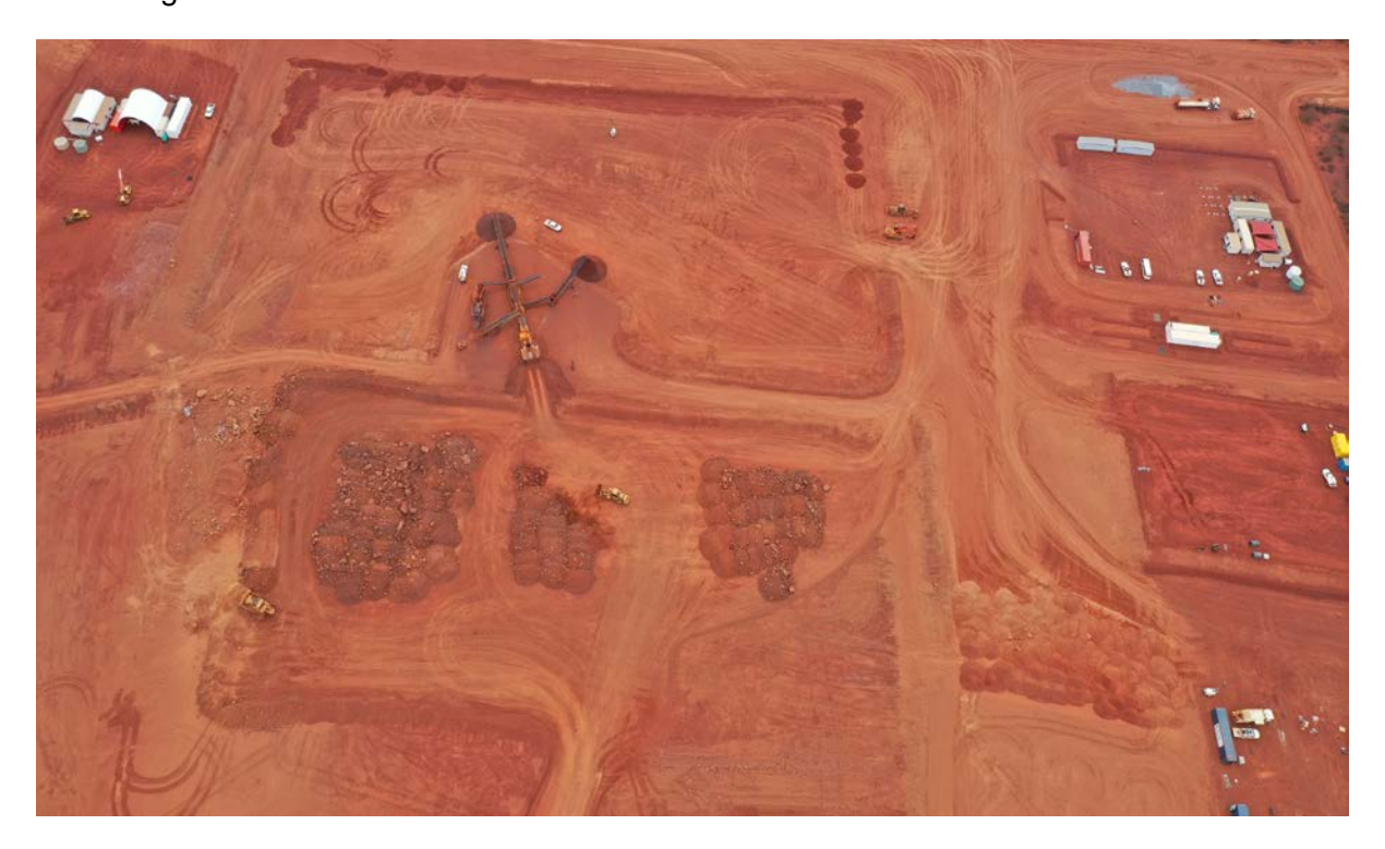
Figure 1: Crusher commissioned and the waste has been mined out of the pit and the Mineralised Waster stocks shown in the centre of the ROM.

With the crusher fully operational, run of mine (ROM) ore stocks are being built for crushing (Figure 1). Operations have now progressed with high grade material being crushed ready for haulage.