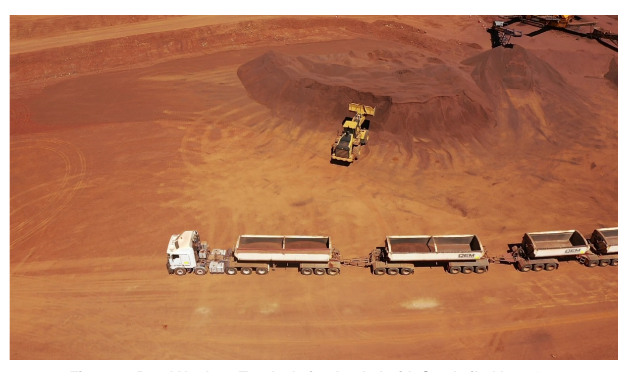
Figure 1: Road Haulage Trucks being loaded with Stockpiled Iron Ore

GWR remains on track to meet our target of first ore shipment in early January 2021 and exploit this strong commodity cycle."