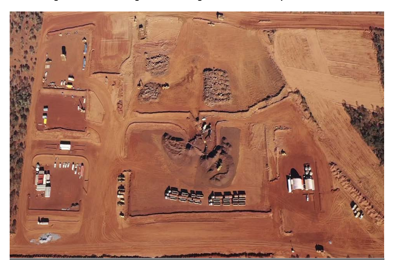
Figure 2: C4 Mine Site works with Trucks lined up ready to be loaded.