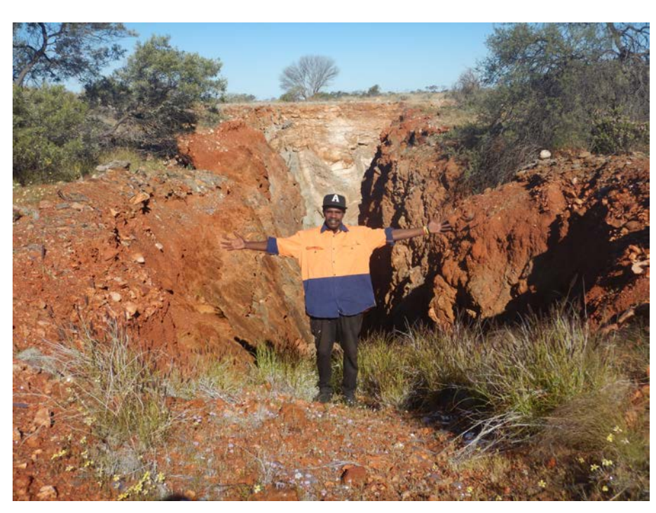
Figure 3 - Historical mine workings Nardoo Well project

It is planned to compile all results achieved to date during the December Quarter.