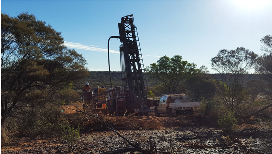
Figure 2 Drill Rig at Golden Monarch