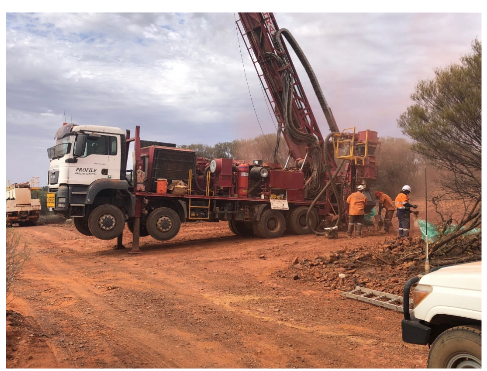
Figure 1: RC Drilling at Golden Monarch.