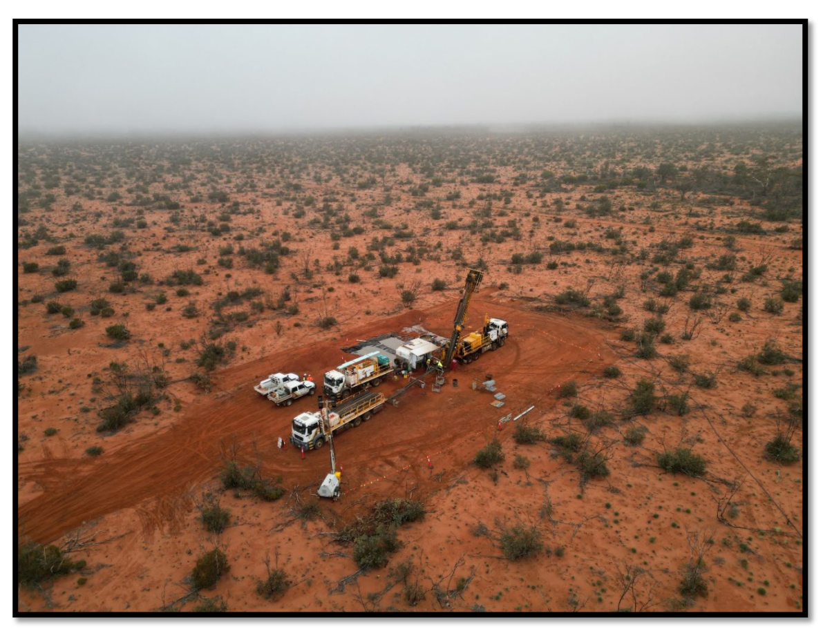
Photo 1: Diamond drilling continues at Octagonal at Target Area A.

The first diamond drillhole (OCDD002) into Target Area B has dropped more than the planned trajectory, which would result in the drillhole missing the targets if drilling continued. As a result, a decision has been made to stop the drillhole short of the seismic and AMT targets. Wedge and navi gear are currently mobilising to site and will be deployed to realign the drill trace to hit the target zone as originally planned. Prior to drilling a wedge drillhole, DHTEM will be conducted on OCDD002 to test for conductors. To eliminate downtime, the drill rig has moved to Target Area A with drilling underway at time of writing.