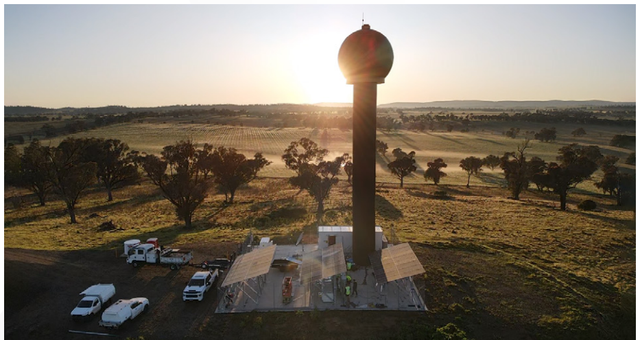
Redflow batteries installed at a Bureau of Meteorology weather radar location.

After a number of frustrating supplier challenges in our Thailand manufacturing facility in early 2023, full production is now back on-line, and we are accelerating our scale up to meet this level of current orders and conversion of additional sales from our pipeline. The facility is now well placed to scale up to 80 MWh p.a. over the next 12 months as battery delivery requirements and timing is confirmed.