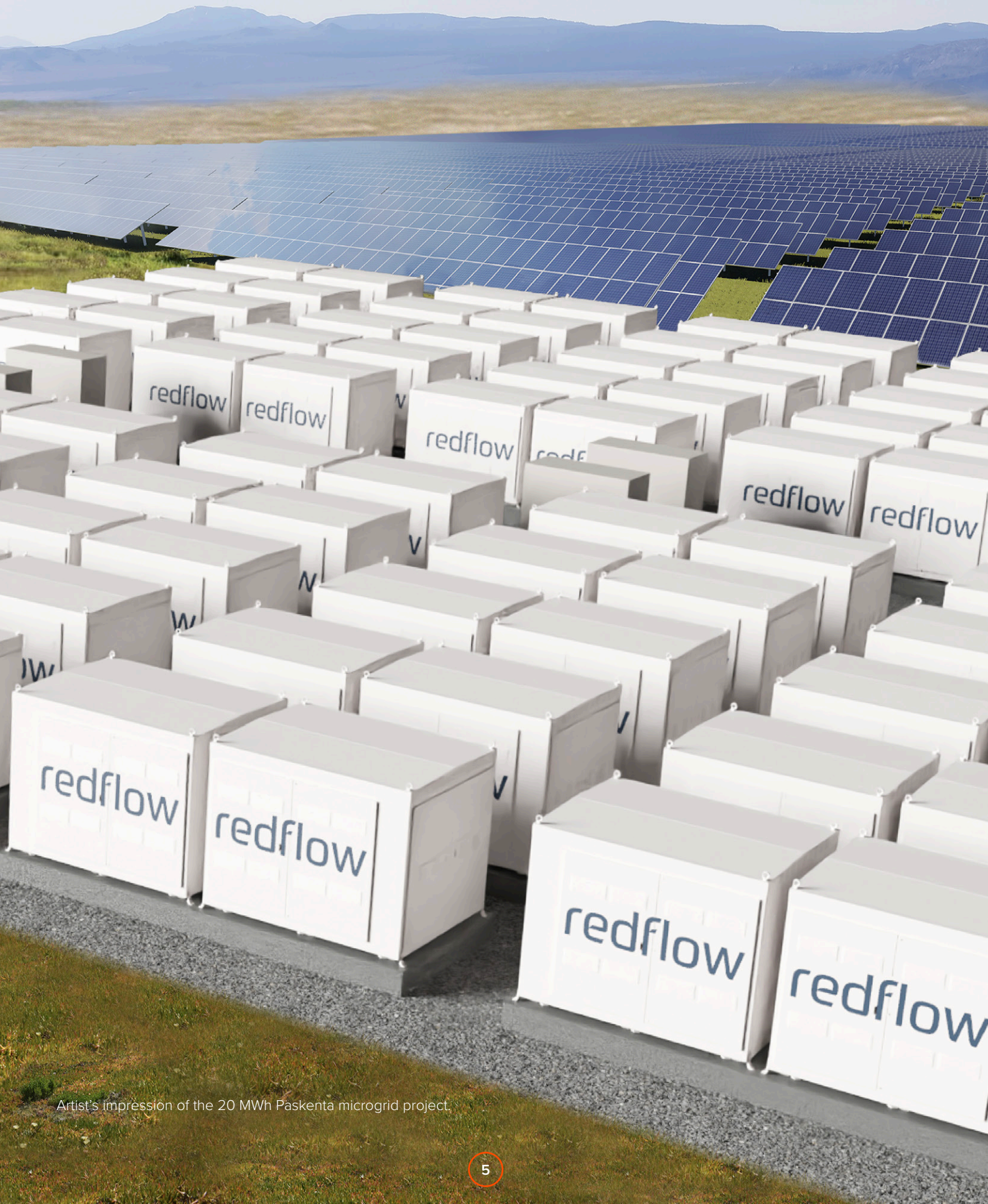
Artist's impression of the 20 MWh Paskenta microgrid project.