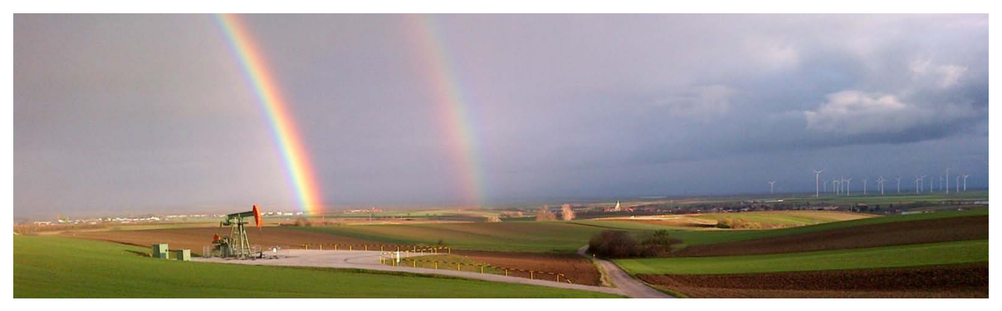
Figure 1: ADX Gaiselberg and Zistersdorf field production infrastructure in the Vienna Basin with wind farms in the background.

ADX will be responsible for managing, planning and the execution of the H<sub>2</sub> Project development. This will require access to the necessary reservoirs, wells, surface facilities and infrastructure for the storage and delivery of produced green hydrogen. ADX will also provide project and operations management services for the installation and operation of hydrogen generation facilities (electrolyser), storage and transportation facilities, as well as the marketing and sale of green hydrogen.