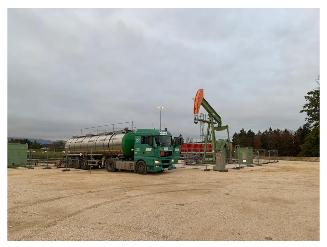
Figure 2: Oil tanker offloading at Anshof-3 location