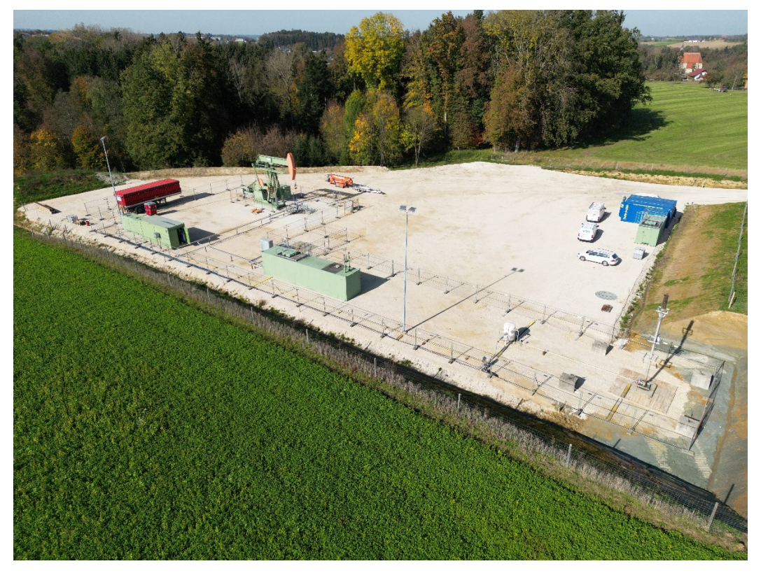
Figure 3: The Anshof-3 well and early production unit