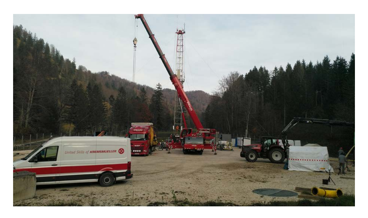
Figure 2: Initial Rig up of workover rig W-102 from RED Drilling & Services at the Welchau-1 well location together with set up of the Flow Testing Facilities