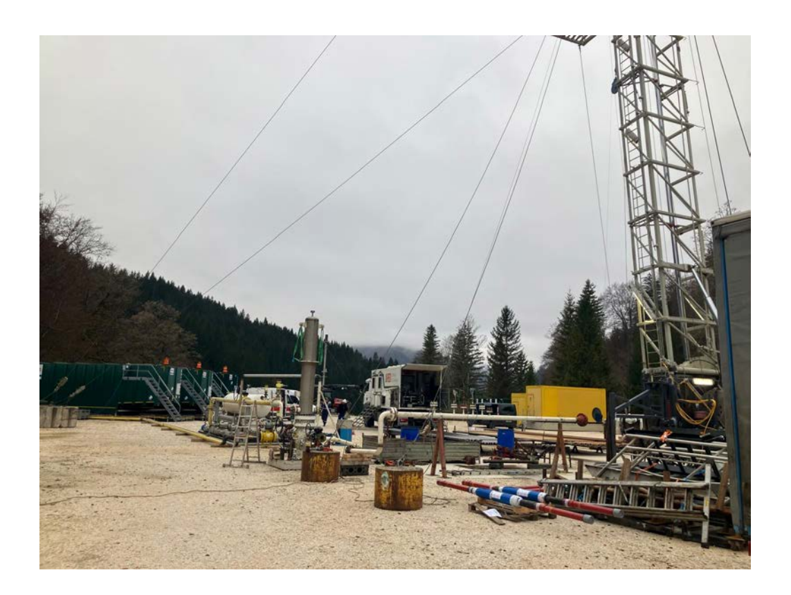
Figure 3: Well completion work and Flow Testing Facilities set up at the Welchau-1 well location in preparation for flow testing the well