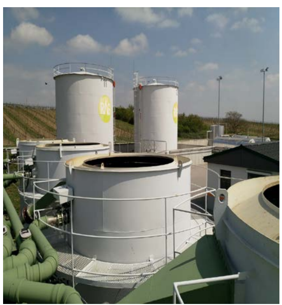
Tank Farm at the Gaiselberg and Zistersdorf Fields

As announced previously ADX has generated approximately Euro 1 million of net revenue from its Austrian operations during the first 3 months of production to the end of February 2020. The funds that have been generated from operations to date further strengthens the Company's financial position during this turbulent period.