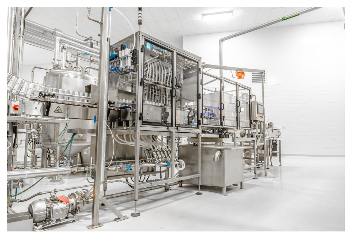
Image 2 - Canned beverages equipment at the Peak Processing facility