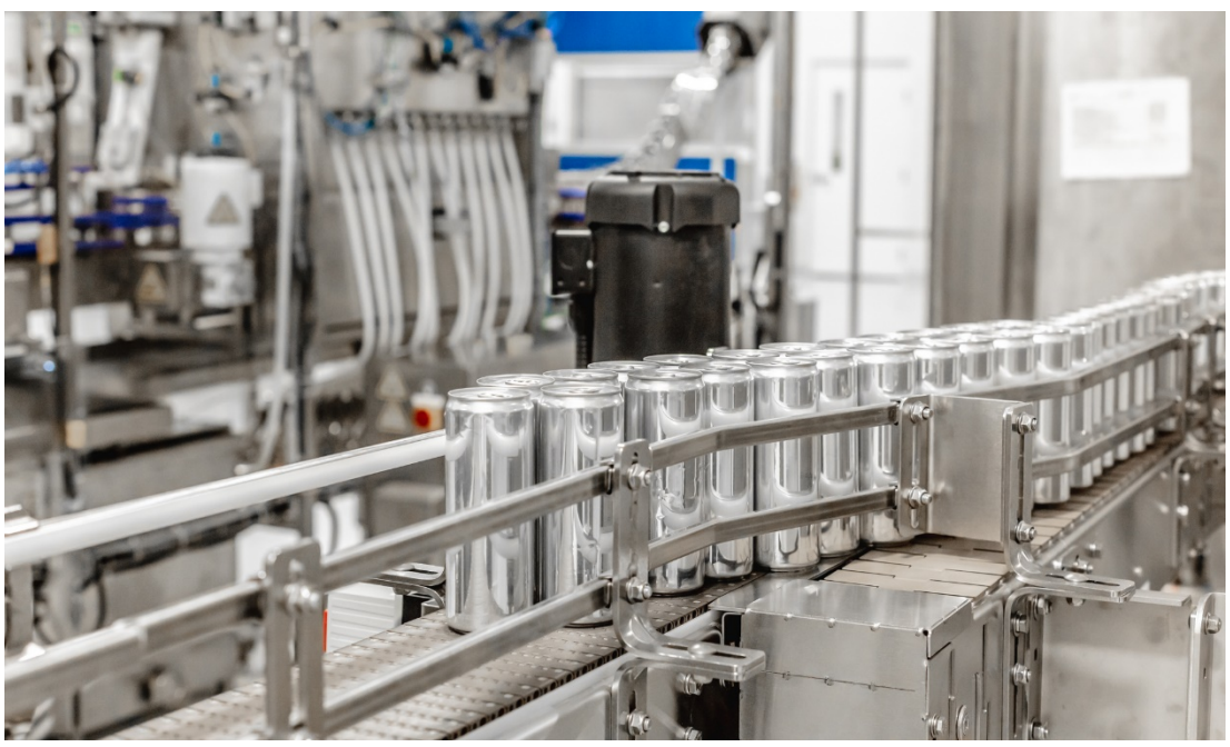
Image 1 – Cannabis beverage manufacturing at the Peak Processing Solutions facility

On 22 June, the Company announced that Peak had signed a binding cannabis beverage production agreement with Collective Project Limited, the cannabis-focused sister company of Collective Arts Brewing Limited, with manufacturing expected to commence during the December 2020 quarter.