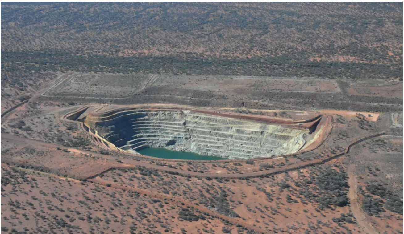
Figure 1. Lord Nelson Existing Open Pit 2017, looking East

Note: While exercising all reasonable due diligence in checking and confirming the data validity, Snowden has relied on the data as supplied by Alto to estimate and classify the Lord Nelson Mineral Resource. As such, Snowden accepts responsibility for the geological interpretation, resource modelling and classification while Alto has assumed responsibility for the accuracy and quality of the underlying drilling data, compiled from WA Department of Mines and Petroleum, Open File WAMEX Reports.