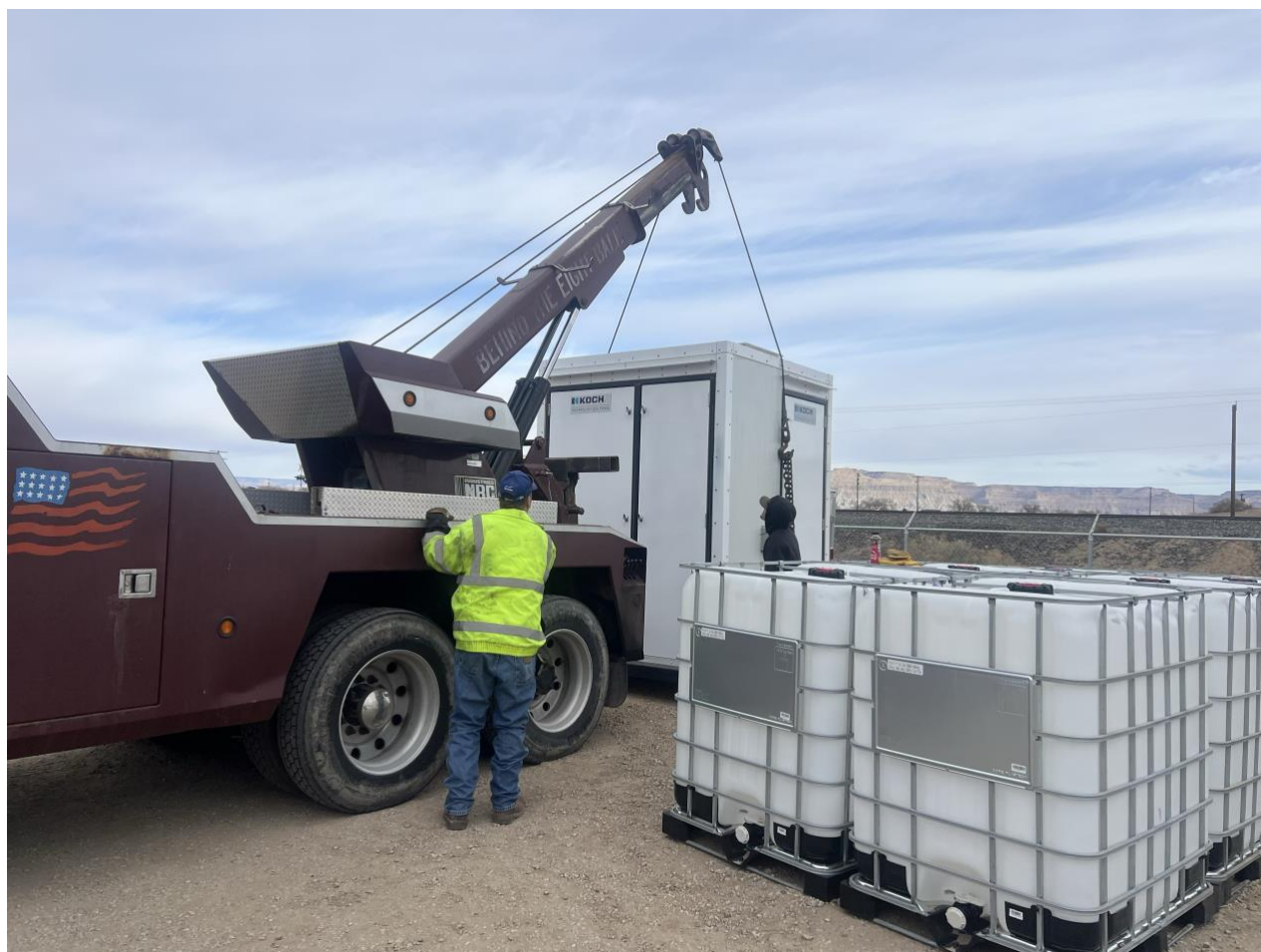
Picture 1: Removal of the Koch Technical Services DLE Pilot Plant from the SDP at Green River

The KTS DLE pilot plant has been removed from the Green River Sample Demonstration Plant to enable the installation of the polishing plant at the SDP, See Picture 1.