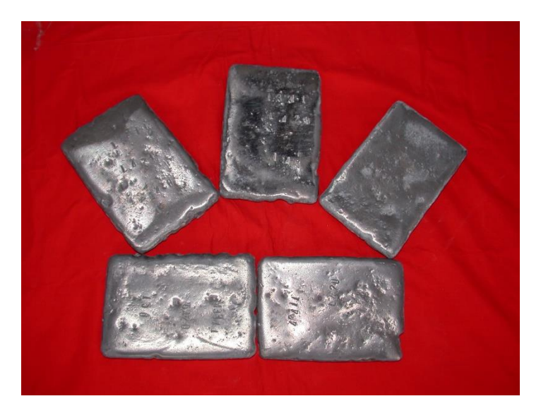
Figure 2 NdPr metal sample from tolling partner

Triangular discussions are advancing between a European end user and their magnet suppliers to assess how Arafura's NdPr metal can be processed to achieve a fully traceable final magnet product. NdPr metal samples from our tolling partner were supplied to the magnet suppliers for the purposes of pre-qualification of the metal sample and the magnet company has confirmed the quality and suitability for use in the final high end magnet product.