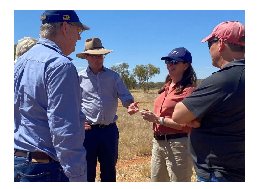
Figure 1 Nolans site visit by Minister for Agriculture and Northern Australia, David Littleproud and Senator Susan McDonald