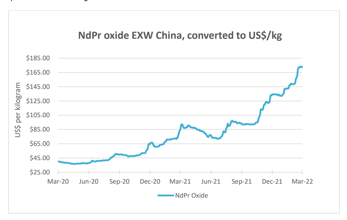
Figure 5: NdPr Oxide Price EXW China inclusive VAT converted to US$

NdFeB magnet demand was strong leading into the quarter, with Chinese production reaching 24,000 tonnes in January to fill orders before Chinese New Year. Demand for magnets for applications including vehicle manufacturing, wind turbines and consumer electronics remains strong globally with Germany, South Korea and the US the market's standout importers of NdFeB magnets.