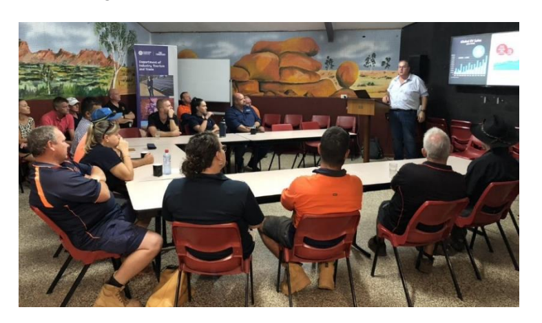
Figure 3 Arafura Roadshow Presentation in Tennant Creek