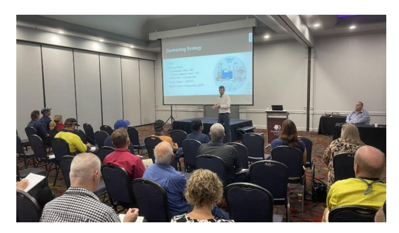
Figure 4 Arafura Roadshow Presentation in Alice Springs

In addition to the roadshow presentations, meetings were held with other key Territory stakeholders including: