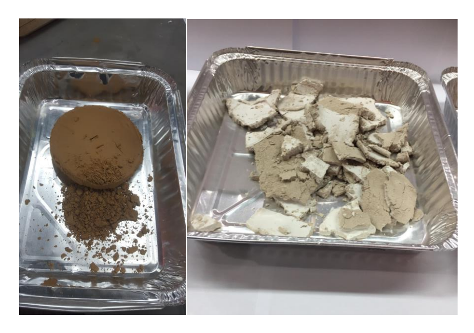
NdPr-rich products from the pilot plant Pre-Leach Residue (L) and Rare Earth Recovery Precipitate (R)