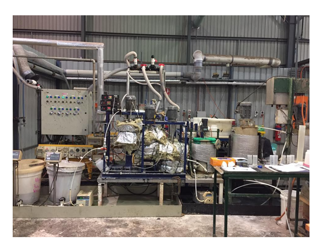
Rare Earth Recovery Circuit