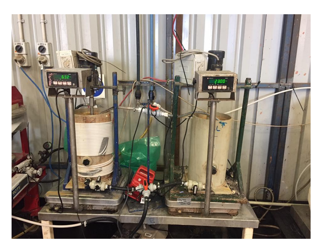
Pre-Leach Filter Feed Tanks