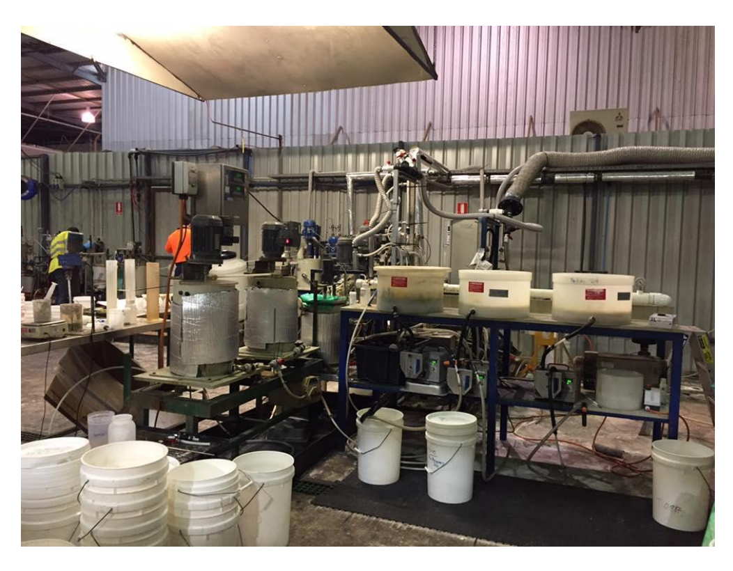
Rare Earth Recovery Filters