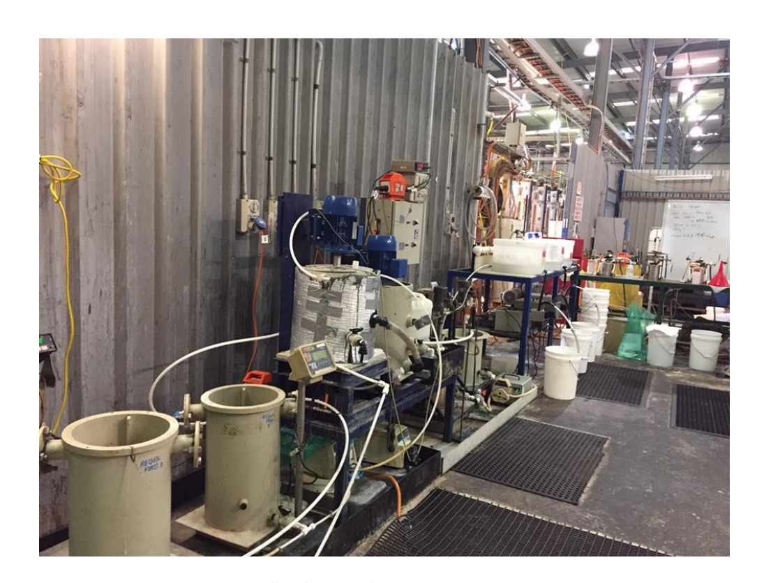
Phosphoric Acid Regeneration Circuit