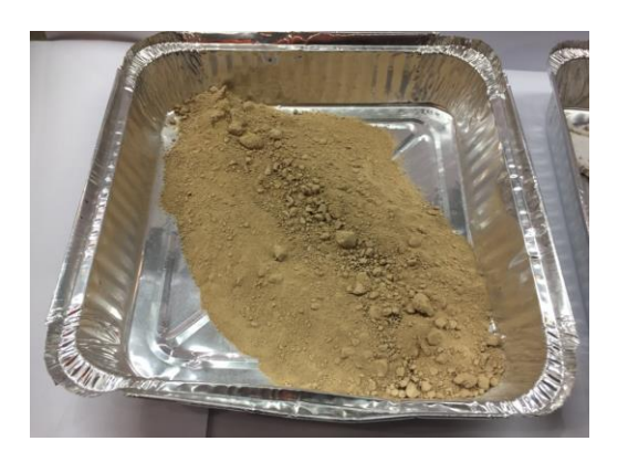
High-Phosphate Concentrate feed to the pilot plant