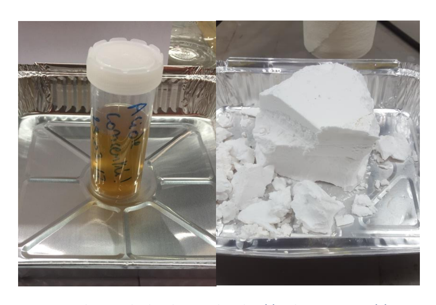
Merchant Grade Phosphoric Acid product (L) and Gypsum waste (R)