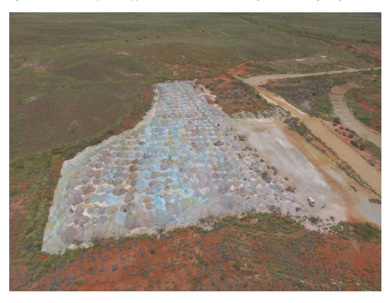
Figure 1: One of the stockpiles of Copper Oxide ore at Whundo containing +50,000 tonnes grading 1.5% Cu.

Historically the Whundo Copper Mine only focused on the mining of copper sulphides. Near surface oxides (surface to 25m-30m depth) were not processed at Radio Hill as they were not suitable as plant feed.