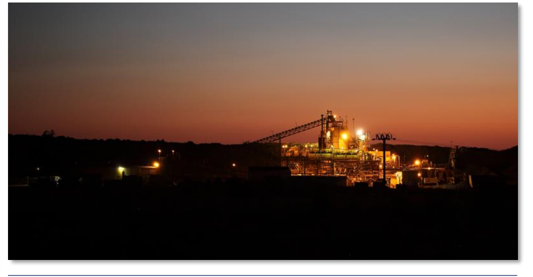
Figure 1: The lights go back on at Radio Hill on 25 November 2017.