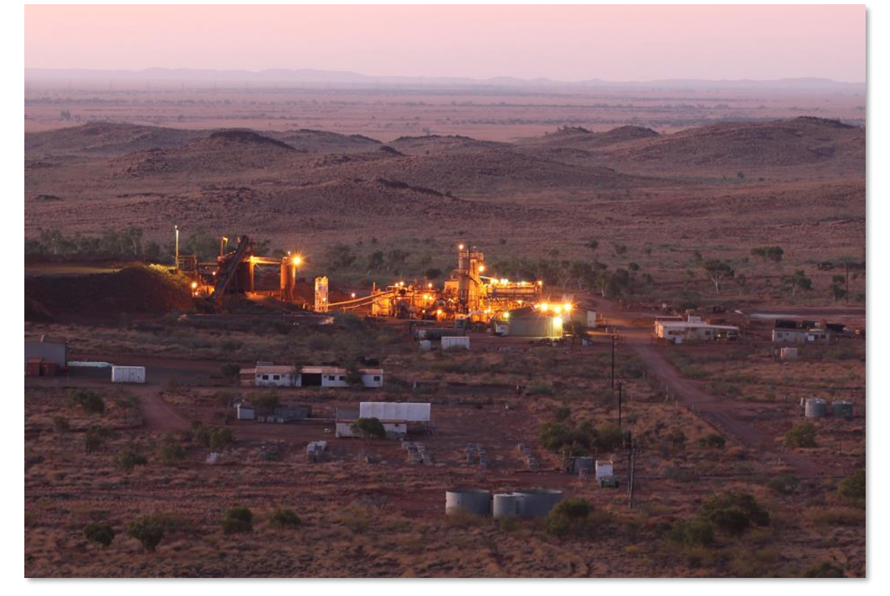
Figure 2: Radio Hill Plant at dusk on Saturday 25 November 2017.

Artemis Resources Limited ("Artemis" or "the Company") (ASX: ARV) is pleased to announce that engineers have now turned the lights back on over the weekend at the Company's fully permitted Radio Hill treatment plant at the radio Hill Nickel/Copper/Cobalt mine, and have commenced refurbishment and upgrade works in earnest. The Mine and Plant were shut down in 2008 as a result of the slump of base metals prices and has since been kept on active care and maintenance.