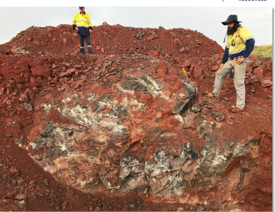
(Figure 4: Wall of the first trench at the Powerline showing. Large boulders are evident in the conglomerate. Dark orange and red staining is from weathered pyrite occurring in the matrix of the conglomerate. Otherwise, the rock is nearly fresh. Trenches are carefully being cleaned of weathered rock in preparation for bulk sampling.)