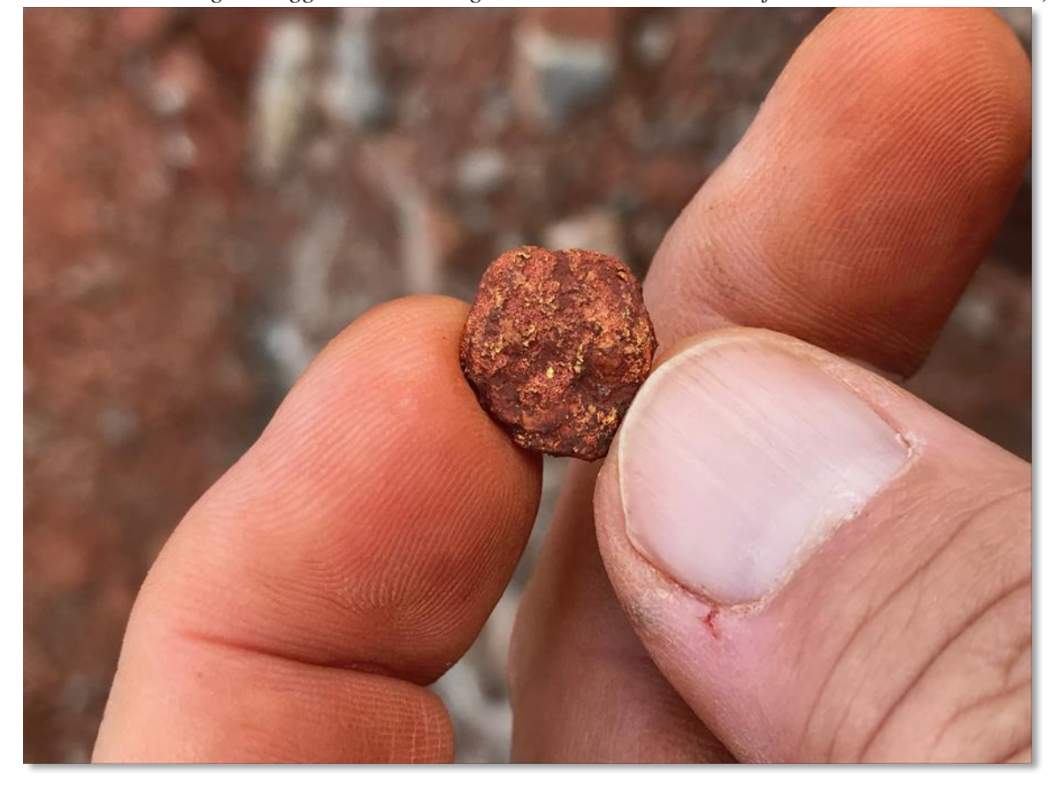
(Figure 3: Gold nugget extricated from matrix of the lower conglomerate at the Powerline showing.)