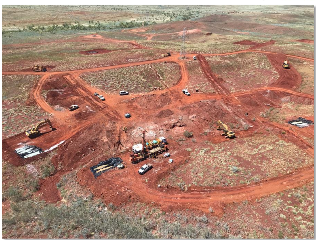
(Figure 2: Aerial photograph of the Powerline showing looking southwest. The first trench to expose bedrock is immediately behind the mast of the diamond core drill. Numerous detector strikes were encountered in multiple layers. The footwall contact of the conglomerate sequence is not exposed in this trench. In situ gold nuggets as see in Figure 3 have been extricated from rock matrix material.)