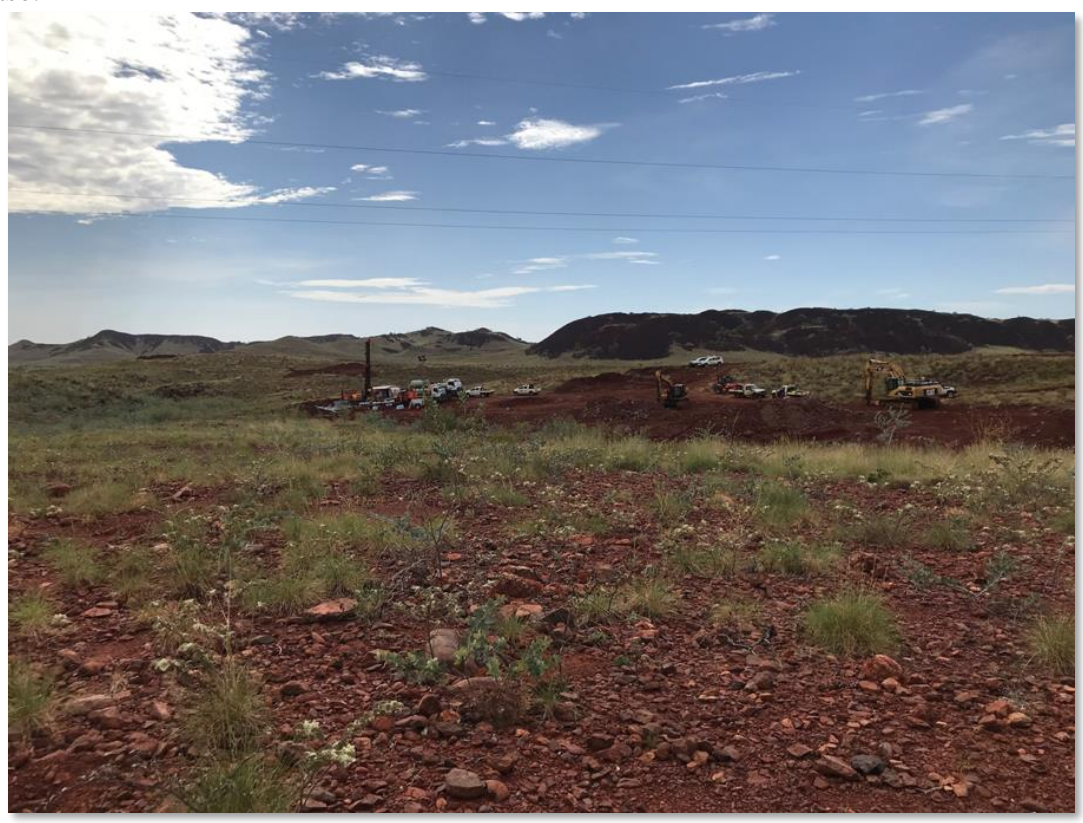
(Figure 1: Photograph of the Powerline showing looking southeast. Trenches are being opened immediately right of the location of the diamond core rig. The base of the conglomerate sequence is in the foreground and the top is approximately where the two white vehicles are parked along the ridgeline. True thickness of the conglomerate section is approximately 30 meters and is dipping away from the camera at about 3-4 degrees.)

Dr. Quinton Hennigh, the Company's, President and Chairman and a Qualified Person as defined by National Instrument 43-101, has approved the technical contents of this news release.