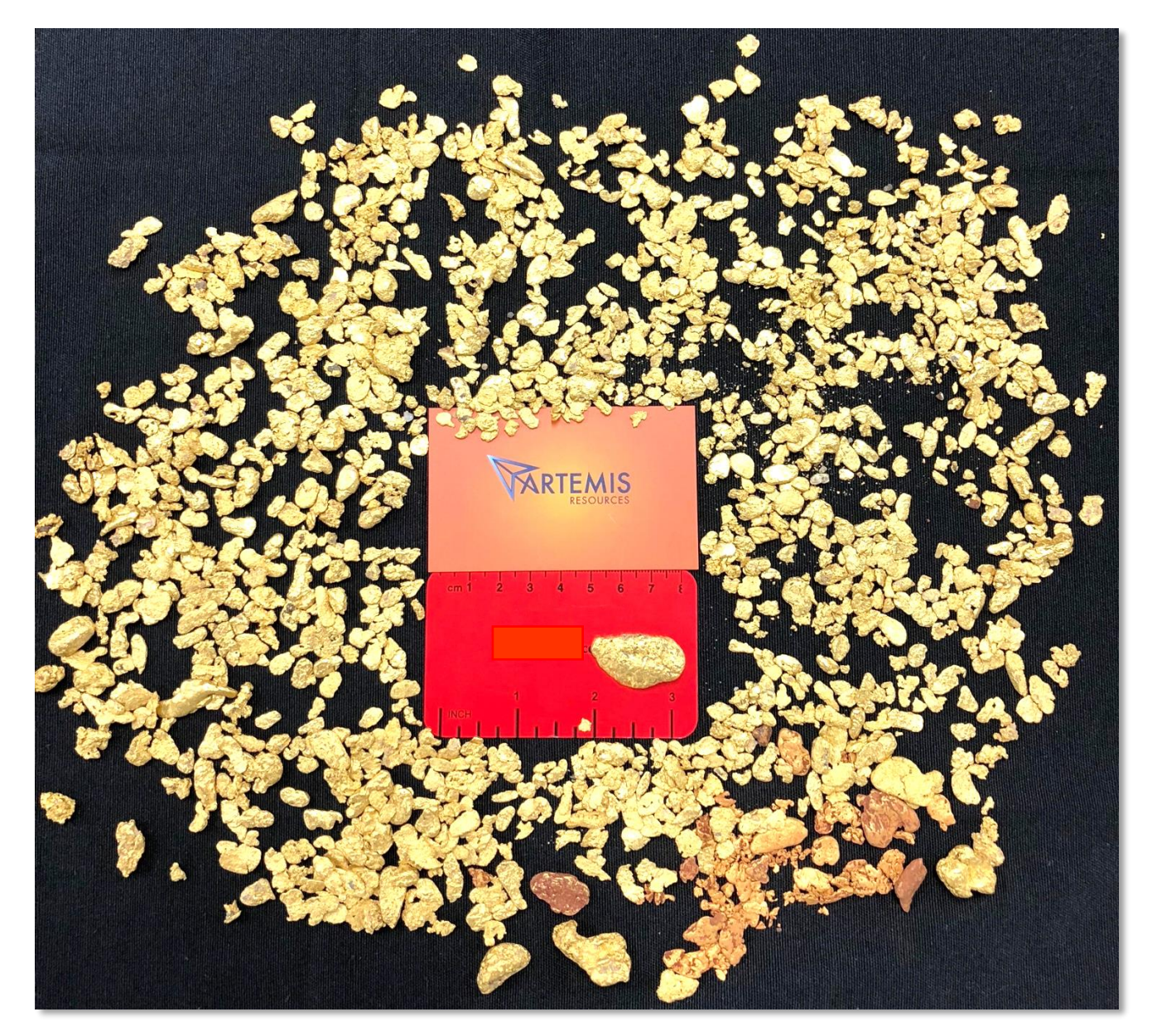
Figure 3 1kg (31.6 oz) of Purdy's Reward gold nuggets<sup>2</sup> recovered before the Novo Resources JV was signed.

<sup>2</sup> Artemis Resources ASX announcement dated 7 August 2017 – Gold Nugget Recovery Continues from Purdy's Reward-