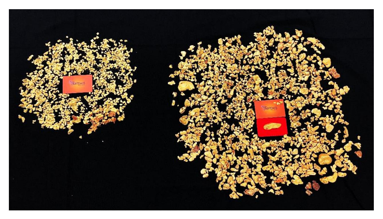
Figure 4 Comparison of Purdy's Reward (left) and 47K Patch (right) conglomerate hosted gold nuggets.