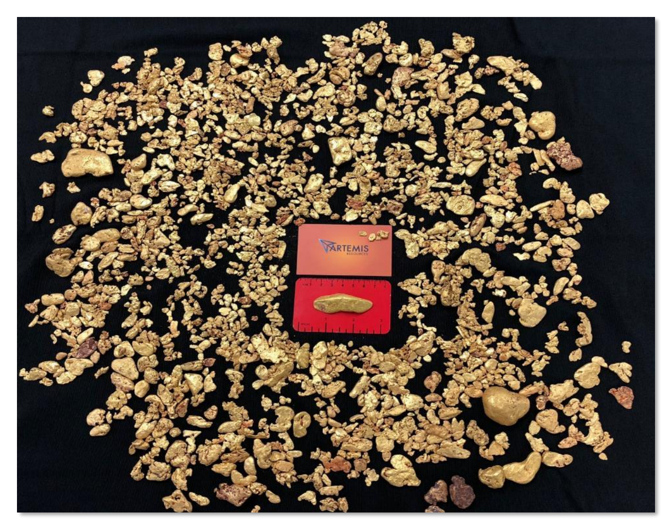
Figure 2 6kg (193 oz) of 47K Patch gold nuggets recovered to date.

47K Patch lies within the Company's Comet Well West tenement package. 47K Patch is within approved tenement E47/3443 which is 70% owned by Artemis.<sup>1</sup> Artemis' interests in its Comet Well West tenements are not associated with Novo Resources Corporation.