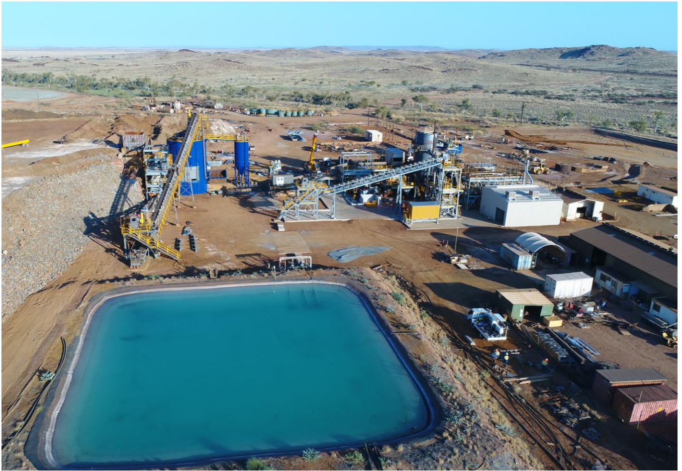
Figure 3: Radio Hill Operations

Mechanical refurbishment and installation of key processing equipment at Radio Hill is now \approx 80% complete with outstanding electrical and instrumentation, minor structural repairs and plant piping to be completed once final approval for TSF3 is received. With respect to TSF3 approvals, the key submission to the relevant government department was delayed during the September quarter due to the slow delivery of key sub-consultant reports.